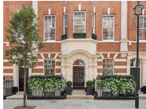
Langham Street, London W1.