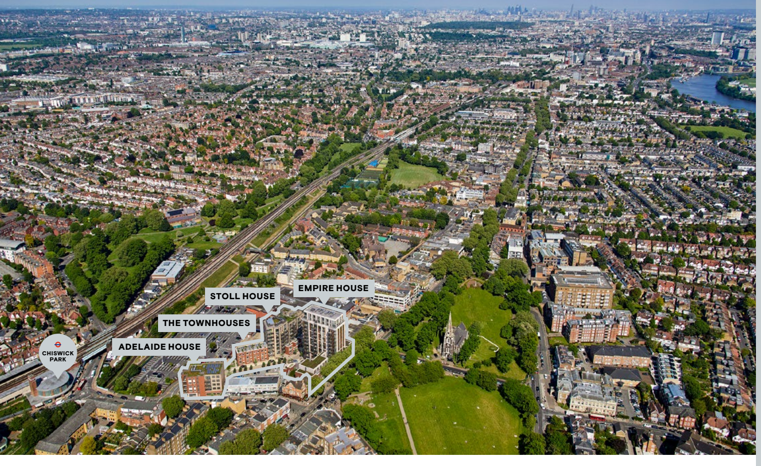
Adjoining the new apartment buildings lies the open space of Turnham Green.