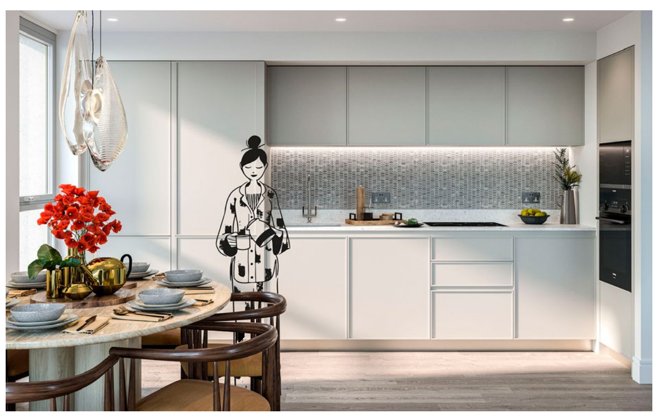
Kitchen cabinetry in a matt lacquer finish with soft closing doors and drawers and integrated Siemens appliances.