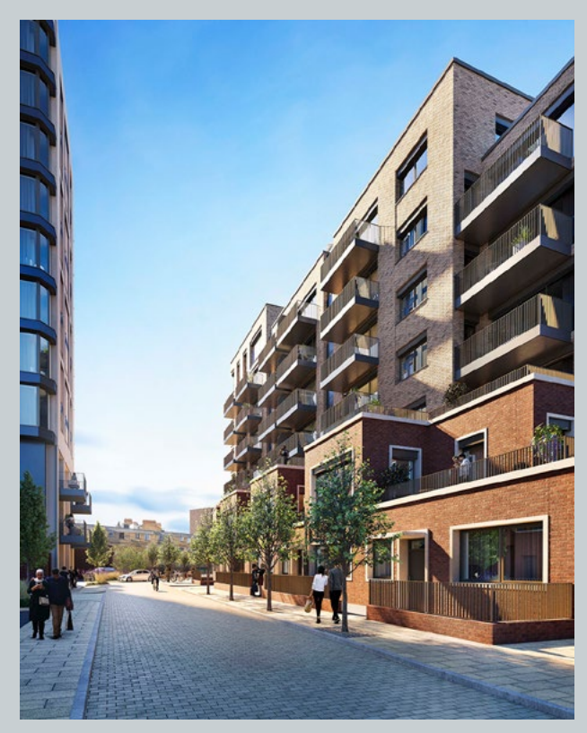
Stoll House overlooking Chiswick Green's tree-lined street.

Exterior view of Empire House overlooking Turnham Green, built on the site where the renowned Chiswick Empire theatre once stood.