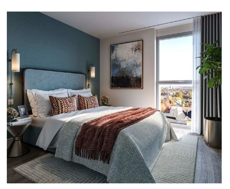
A calming palette inspires the interiors and maximises natural light.