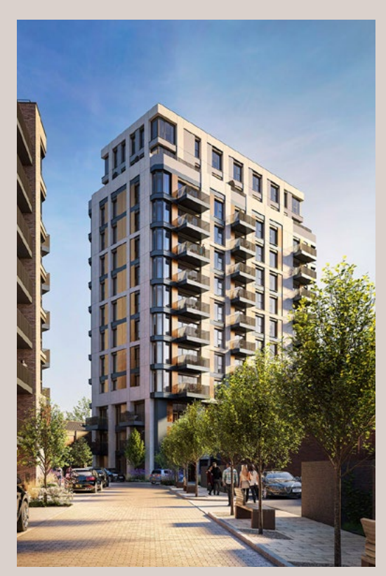
The landscaped, tree-lined approach to Empire House from the north.

The architectural design at Chiswick Green is by award-winning practice, Assael, with effortlessly sophisticated interiors by Millier.