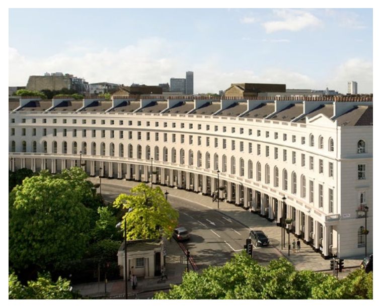
Regent's Crescent, London W1.