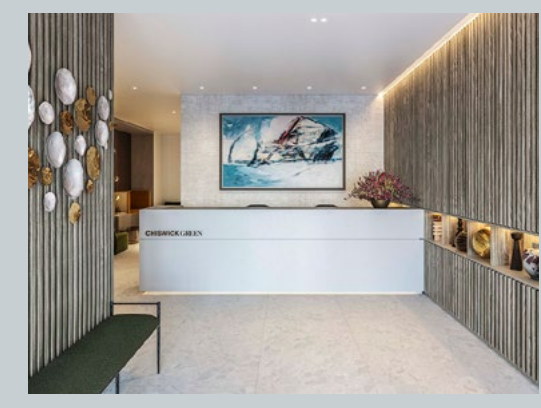
Lobby at Empire House, with concierge service.

Whichever building you choose, each apartment's elegant interior palette is complemented by a high specification of natural finishes and tactile detailing. Residents also benefit from a beautifully appointed entrance lobby with dedicated concierge service on the ground floor, private balconies or terraces and communal roof terraces.