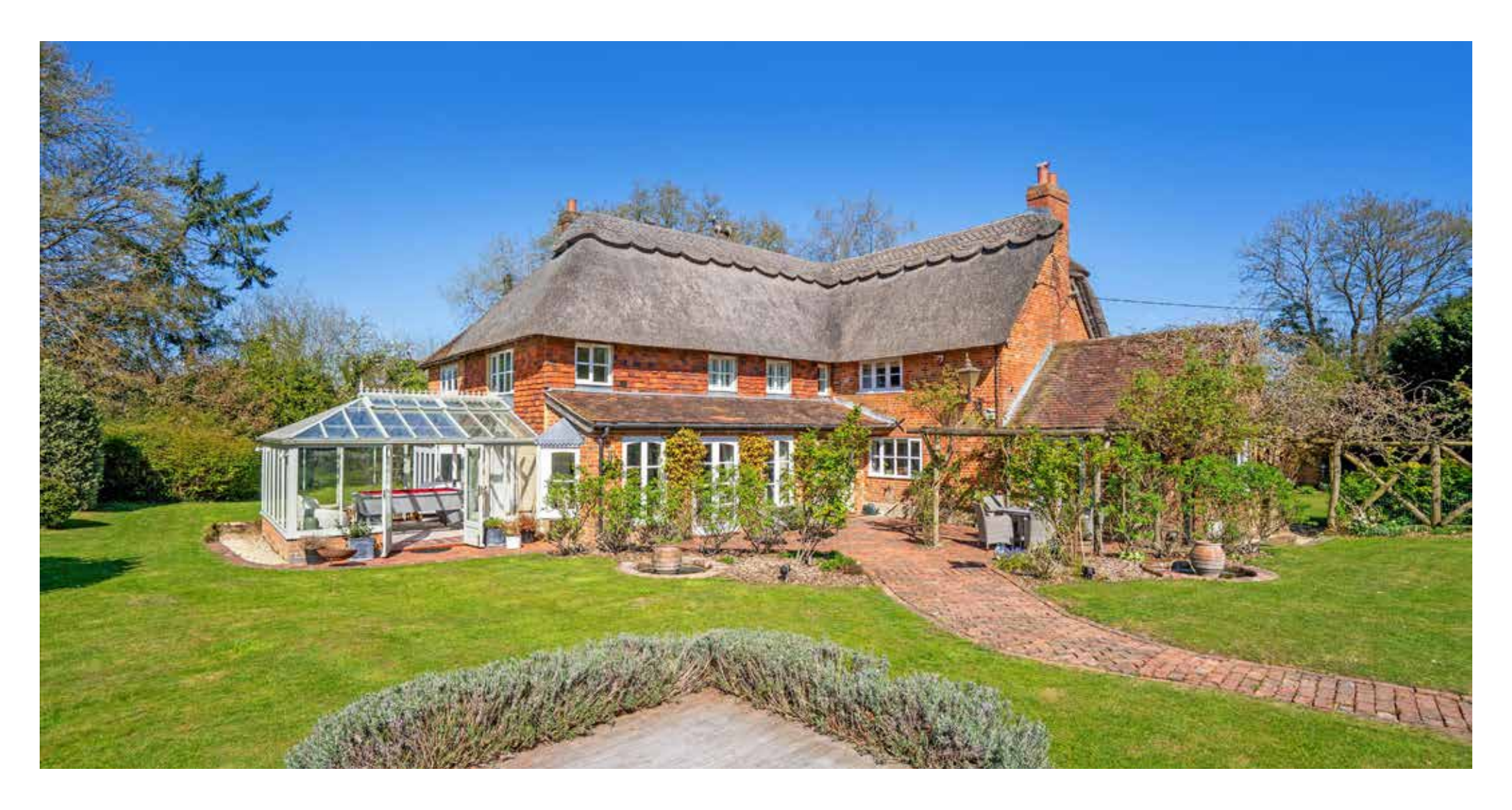
HAYDENS PIGHTLE, OLD BASING, HAMPSHIRE