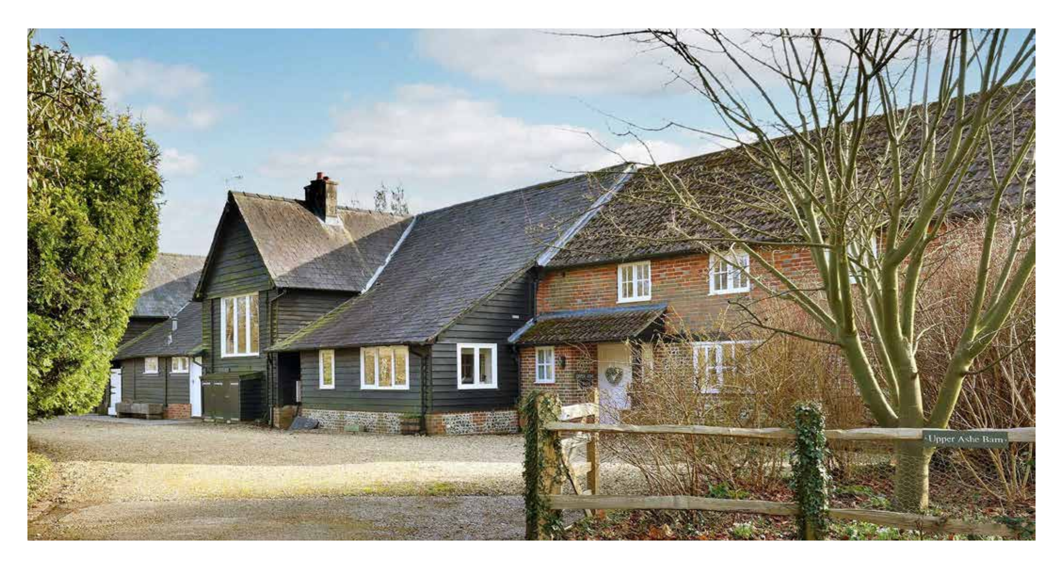
UPPER ASHE BARN, ASHE