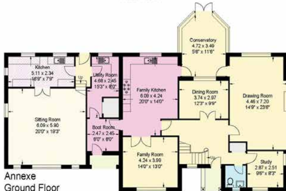
Annexe Ground Floor