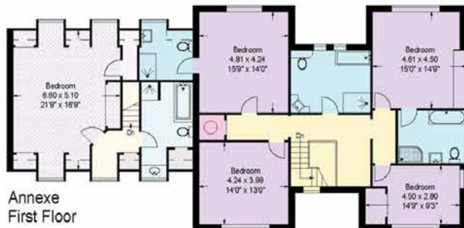
Annexe First Floor

Approximate Gross Internal Floor Area House: 371sq.m. or 3993sq.ft. (Inc. Annexe) Studio: 19sq.m. or 205sq.ft. Garage: 42sq.m. or 452sq.ft. Total: 432sq.m. or 4650sq.ft.