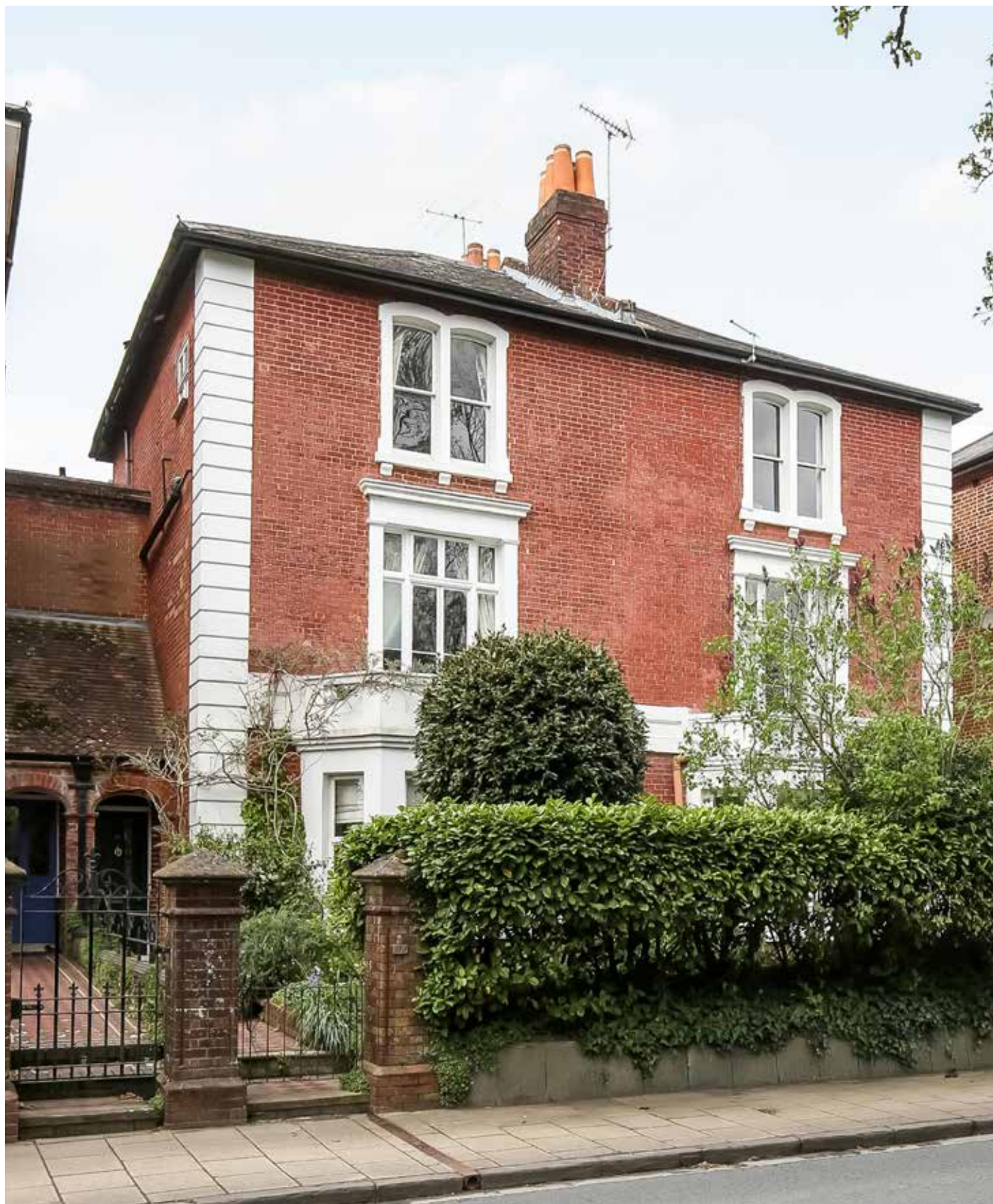
ST CROSS ROAD, WINCHESTER Hampshire