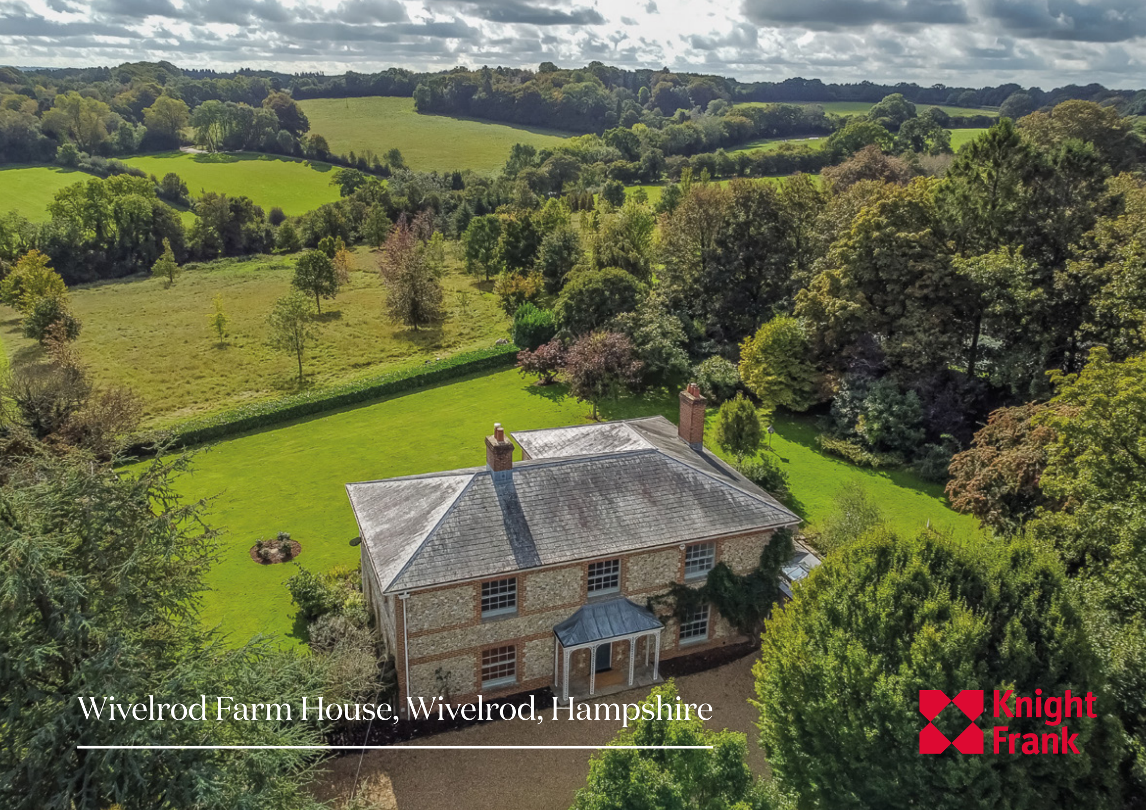
Wivelrod Farm House, Wivelrod, Hampshire