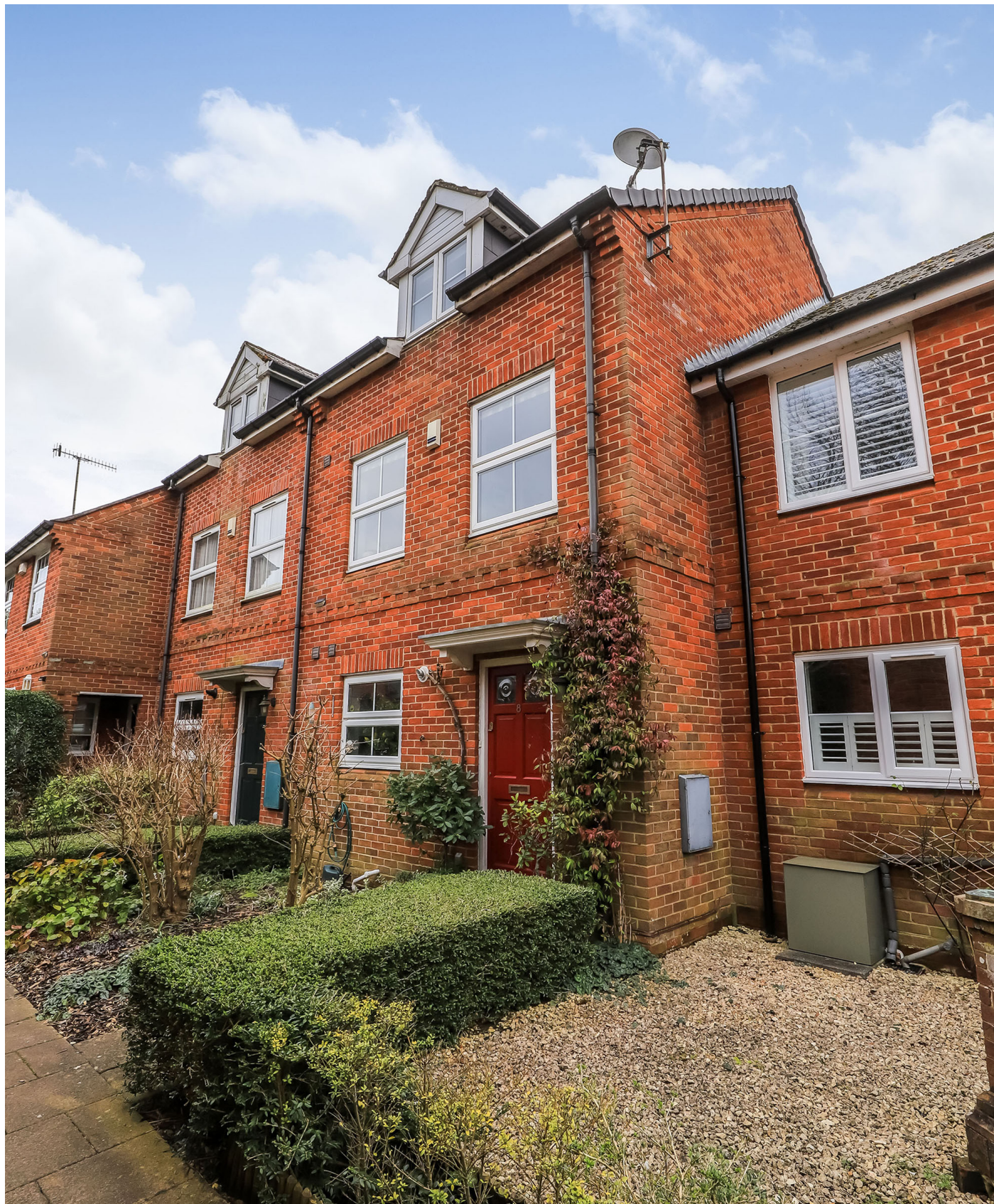
MERCHANTS PLACE Upper Brook Street, Winchester