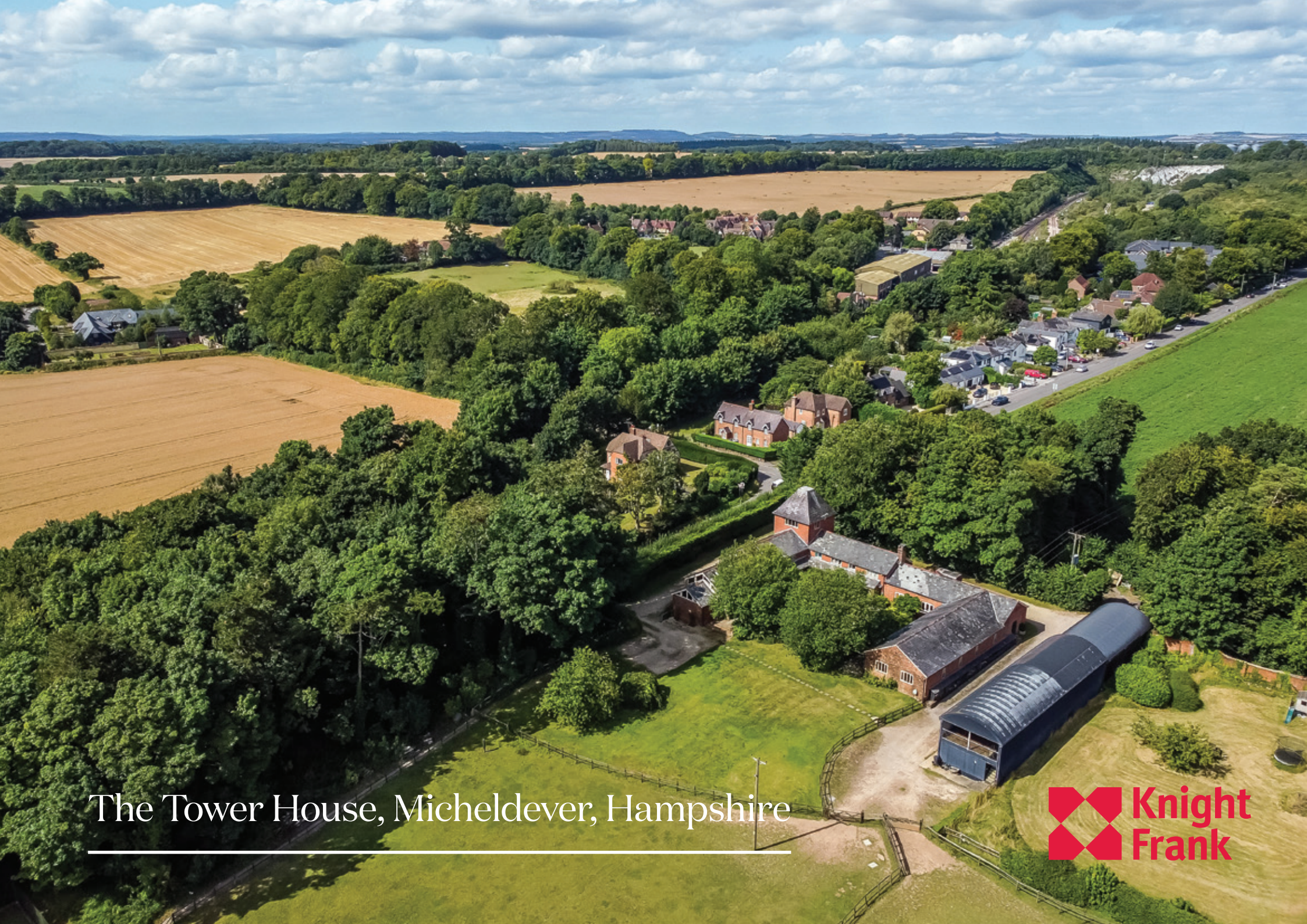
The Tower House, Micheldever, Hampshire