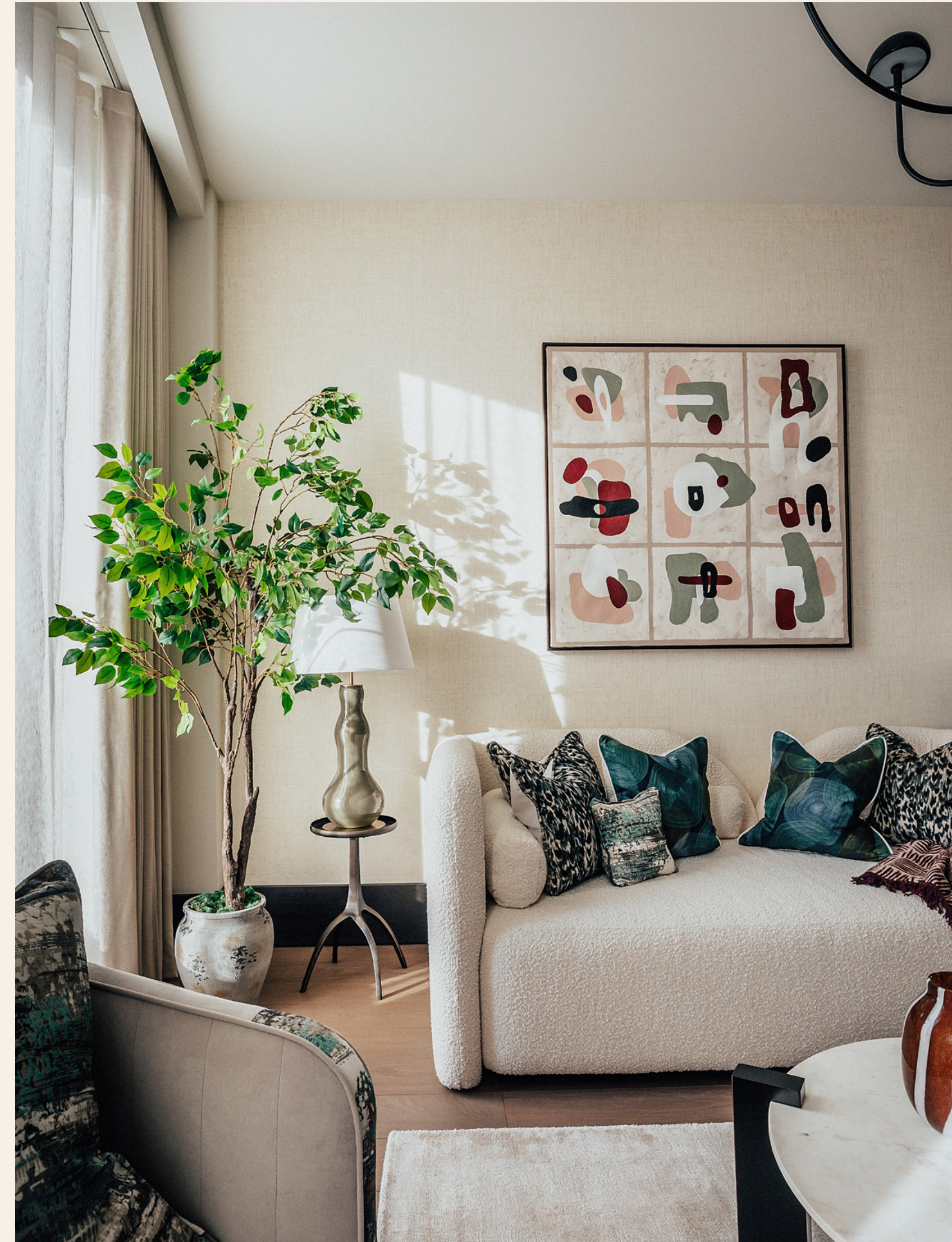
Photography features Show Apartment 3.08, the same layout as Apartment 2.08