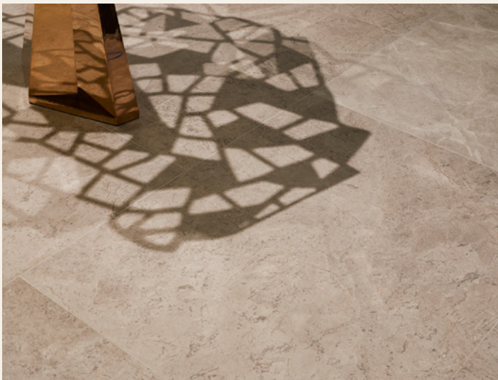
Interlocking Tundra Grey marble flooring

Apartment 2.08 at The Bryanston, features Crestron home integration system, Bulthaup kitchen, Wolf cooking and Subzero refrigeration equipment, Ziptap, large-format stone in the bathroom and kitchen, oak floors, and Dornbracht sanitaryware.