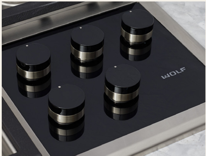
Wolf cooking appliances