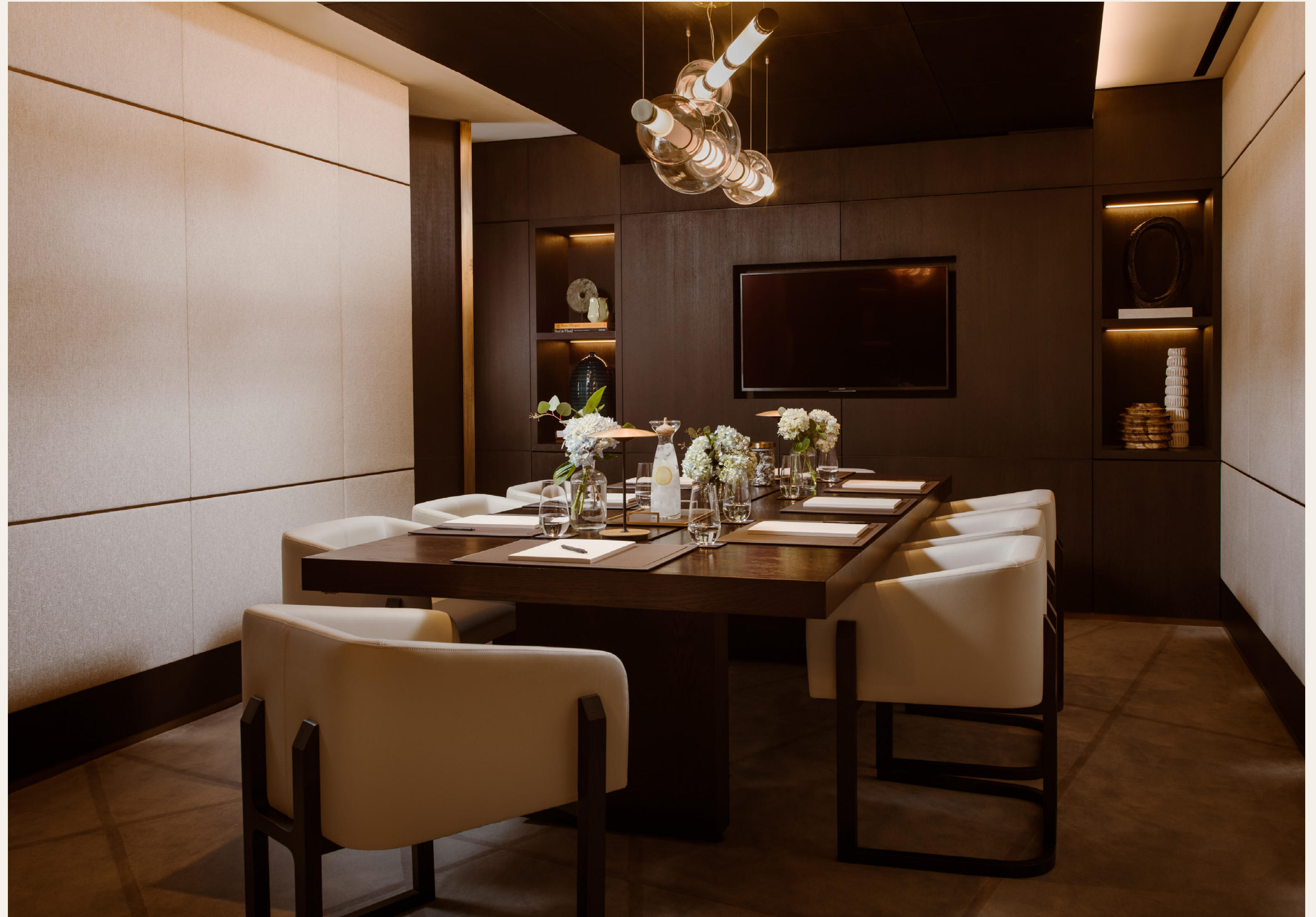
Business suite: consisting of two interconnecting rooms for meetings or private dining

The Bryanston business suite comprises two generous interconnecting meeting rooms and a welcoming reception area. An adjoining service kitchen is fully equipped to cater for refreshment breaks, light snacks, business lunches or private dining events. Furnished with state-of-the-art AV facilities and secure wi-fi, the business suite offers a relaxed, elegant and considered environment in which to conduct business. Residents can book the business suite via the concierge.