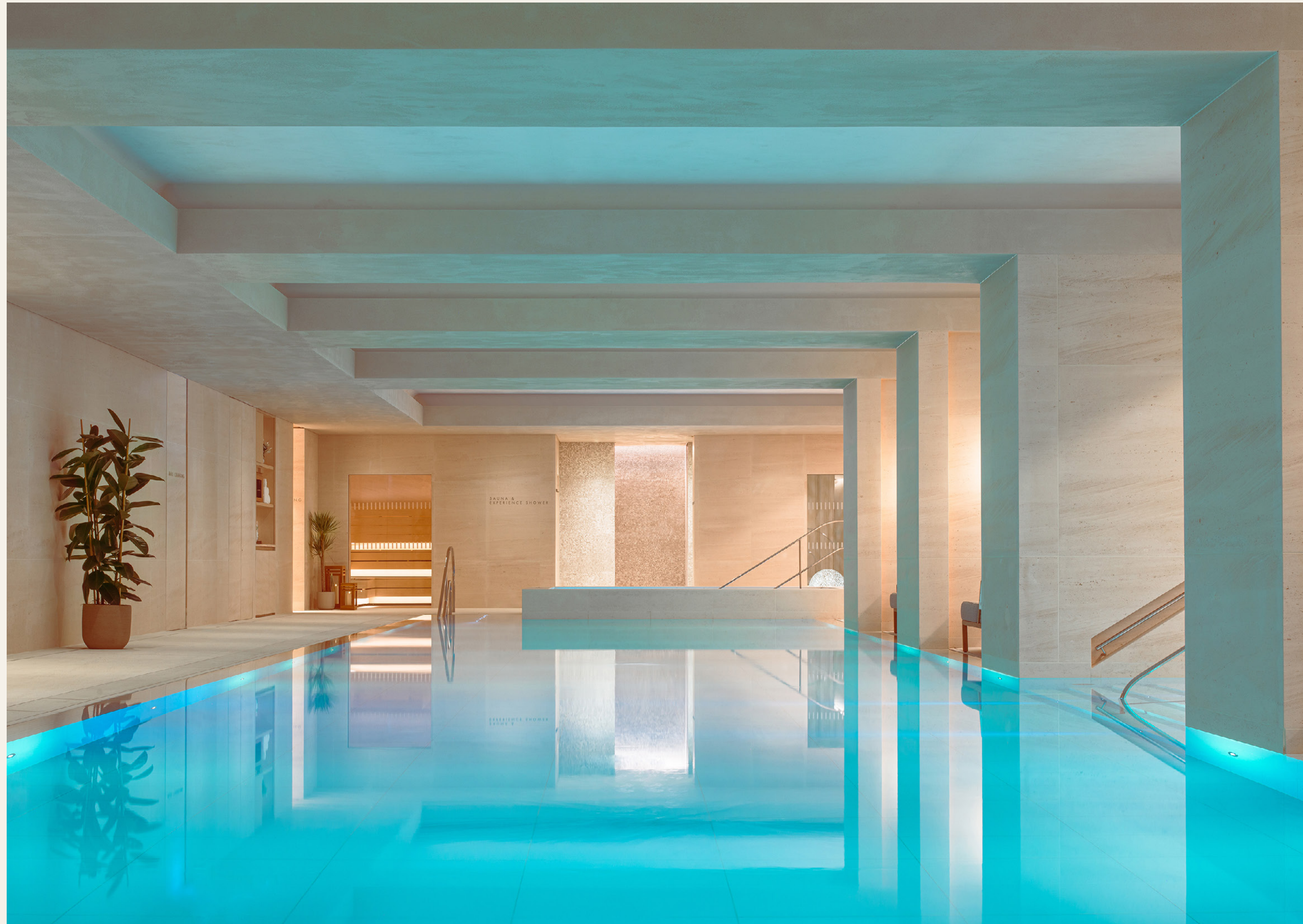
25m Indoor Swimming Pool