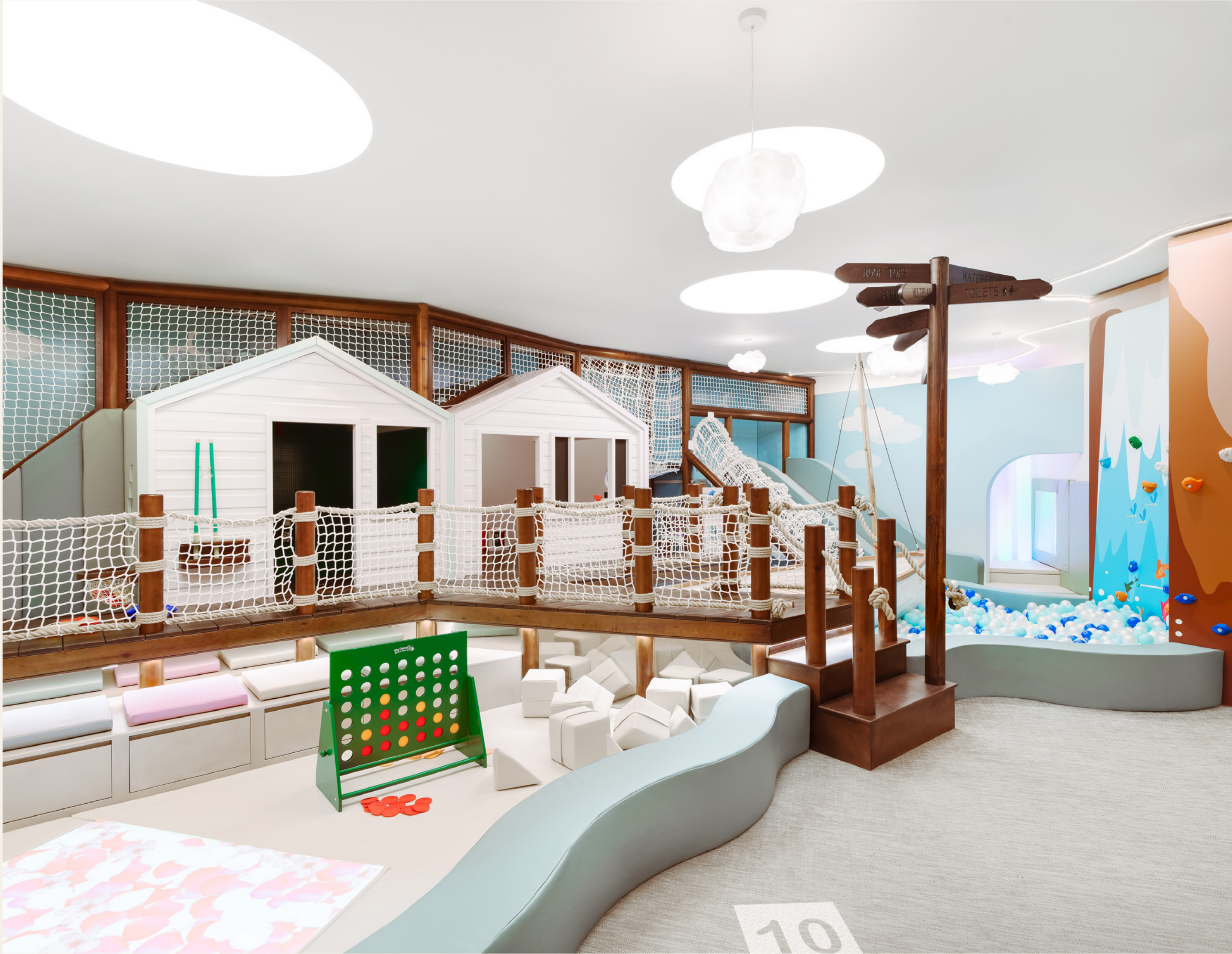
Children's Play Space

From a beautifully appointed spa and 25m swimming pool, to a private cinema and a children's play space, residents can work, play and relax in immaculately designed surroundings.