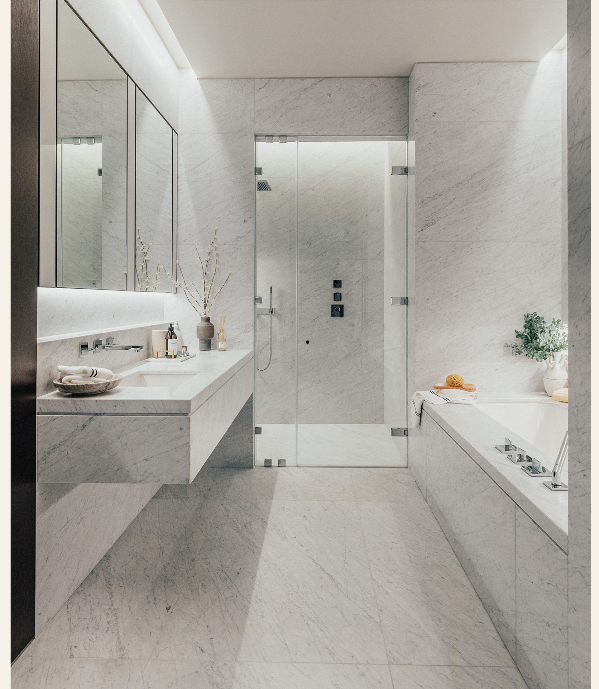
Photography features Show Apartment 3.08, the same layout as Apartment 2.08