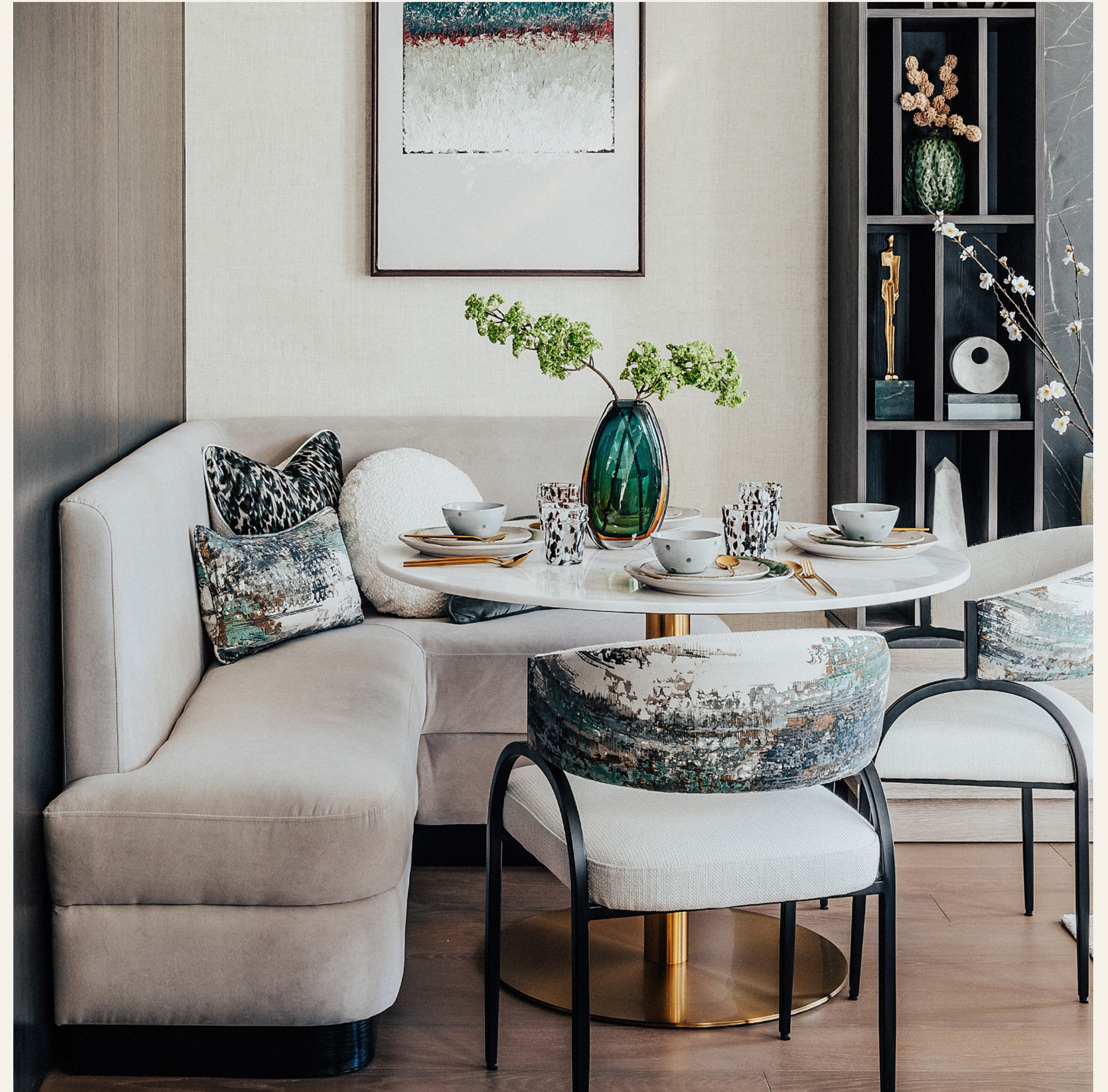
Photography features Show Apartment 3.08, the same layout as Apartment 2.08