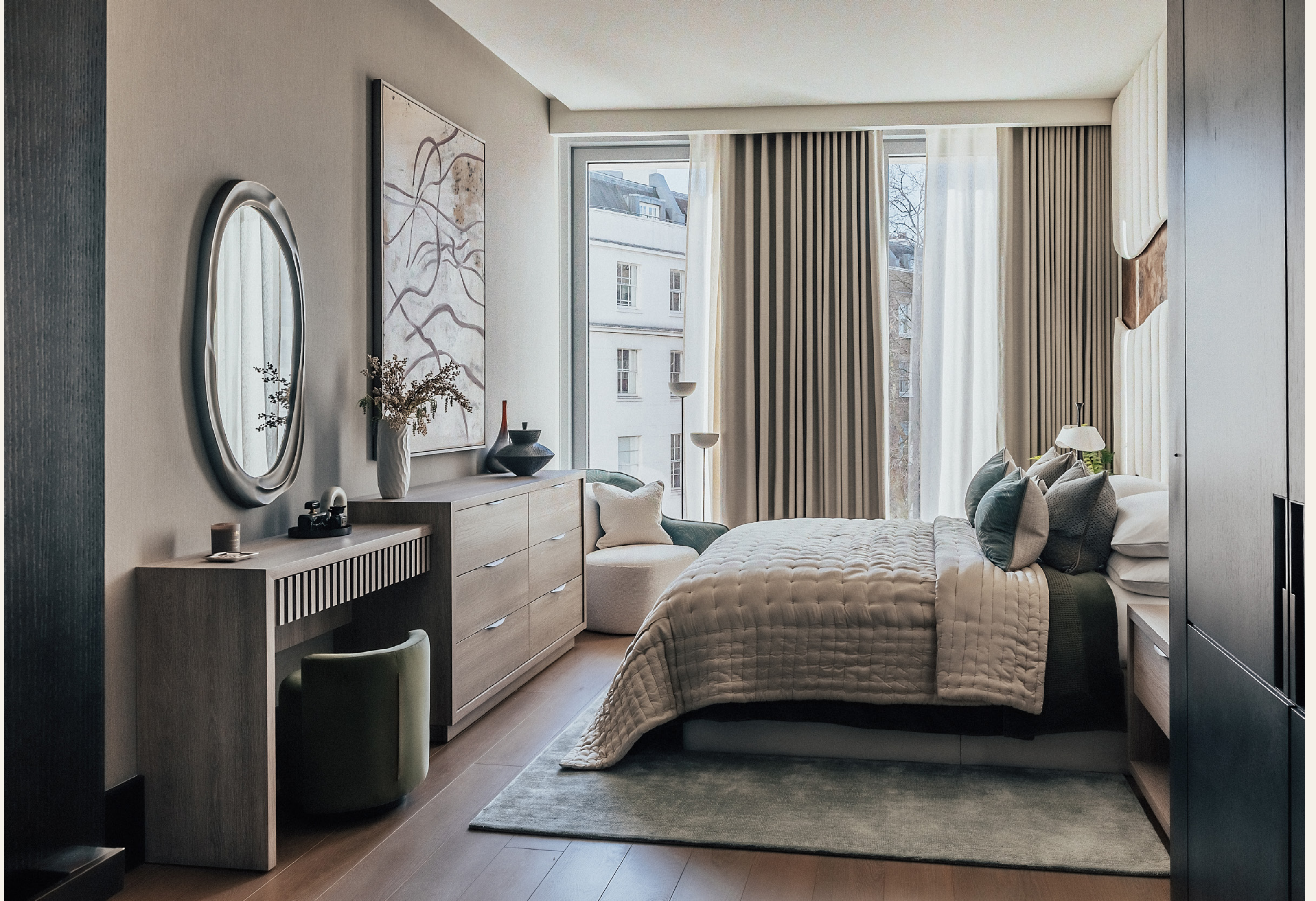
Photography features Show Apartment 3.08, the same layout as Apartment 2.08