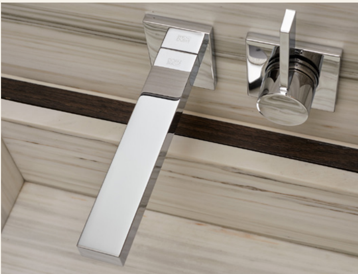
Dornbracht chrome brassware