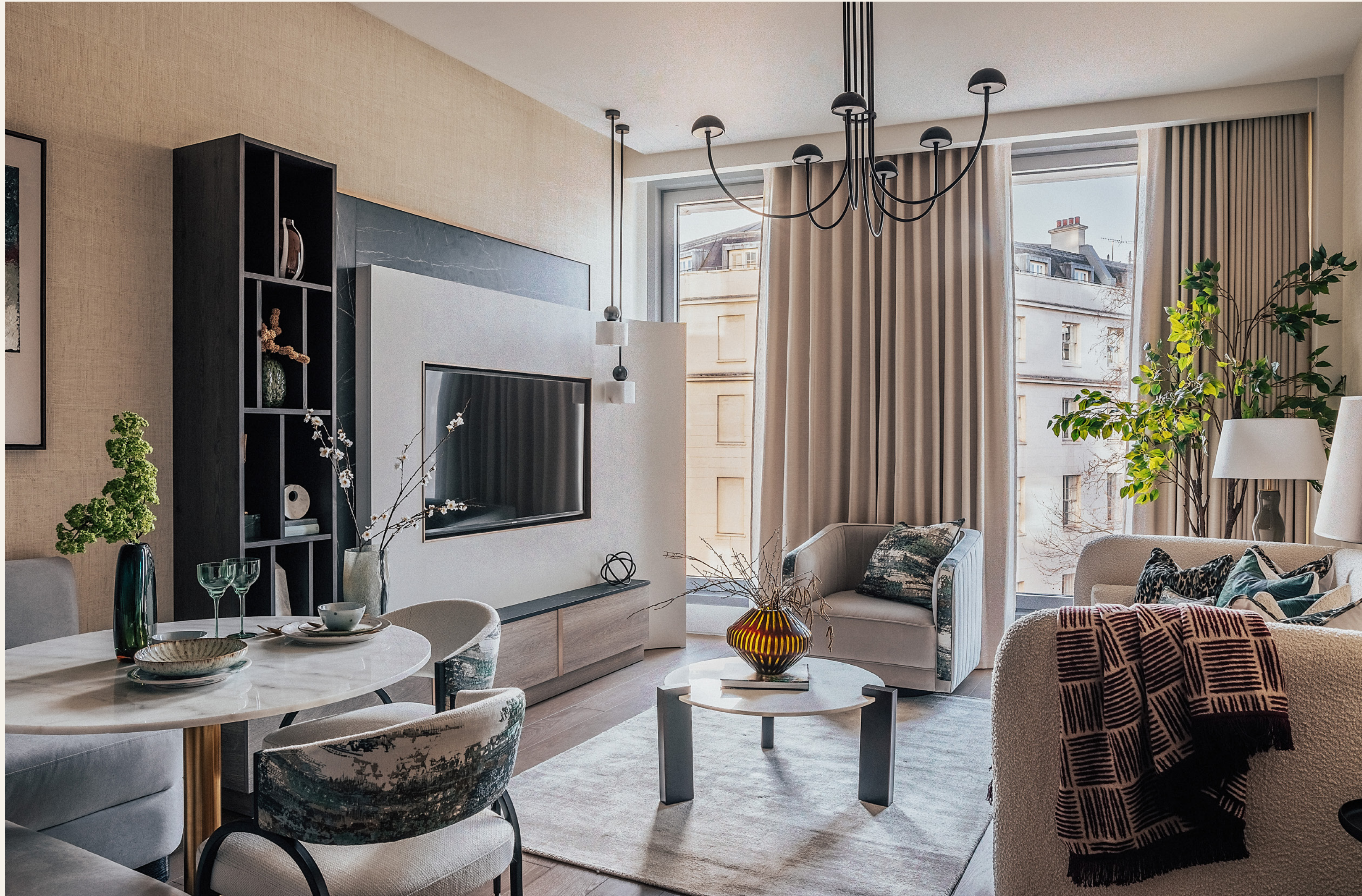
Photography features Show Apartment 3.08, the same layout as Apartment 2.08