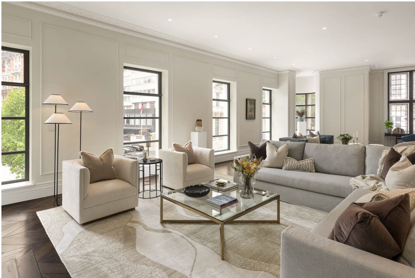
Residence 1 at Knightsbridge Gate 1 William Street, London, SW1X 9HL