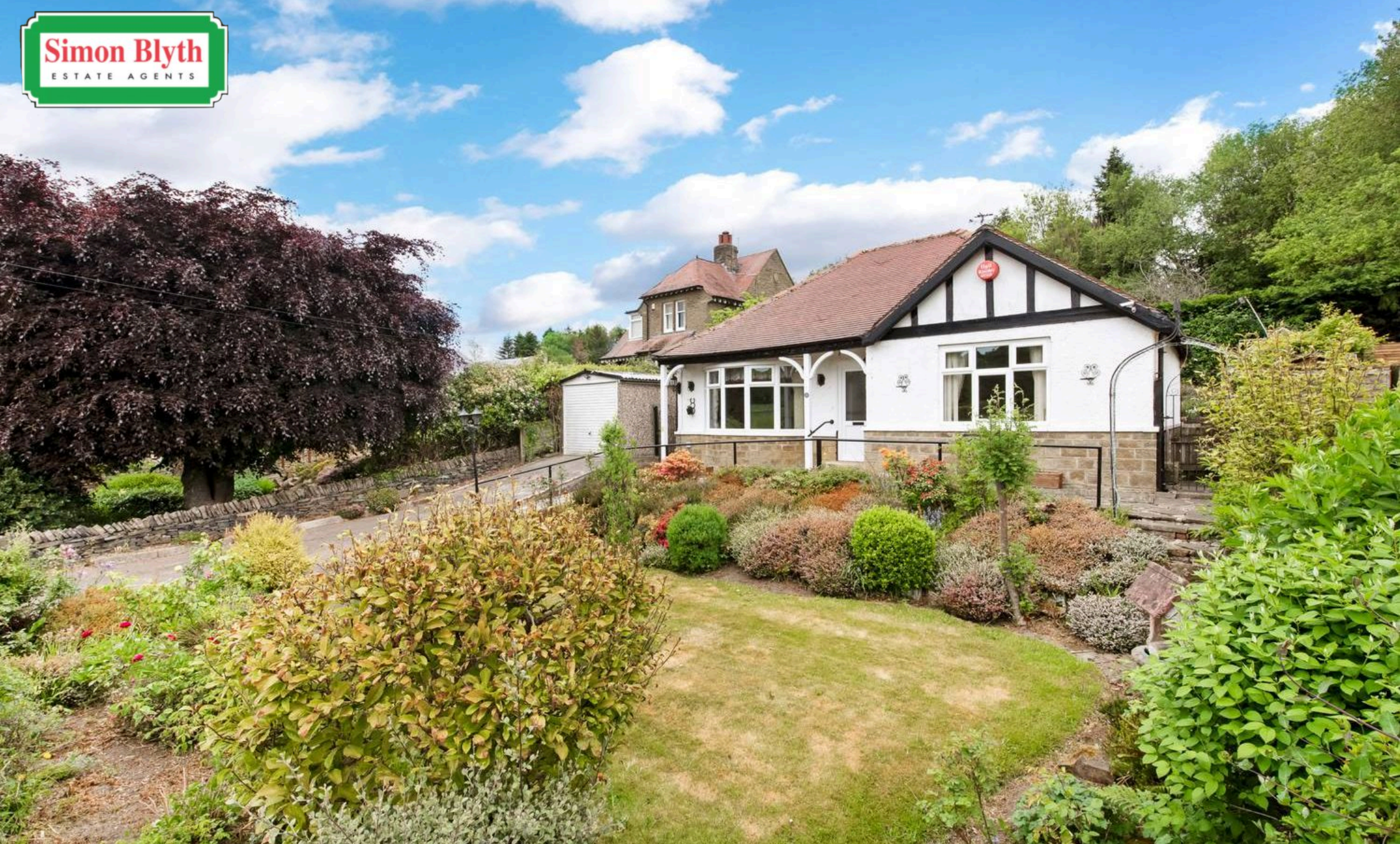
Meadow Bank, Abbey Road Shepley, Huddersfield, HD8 8EP