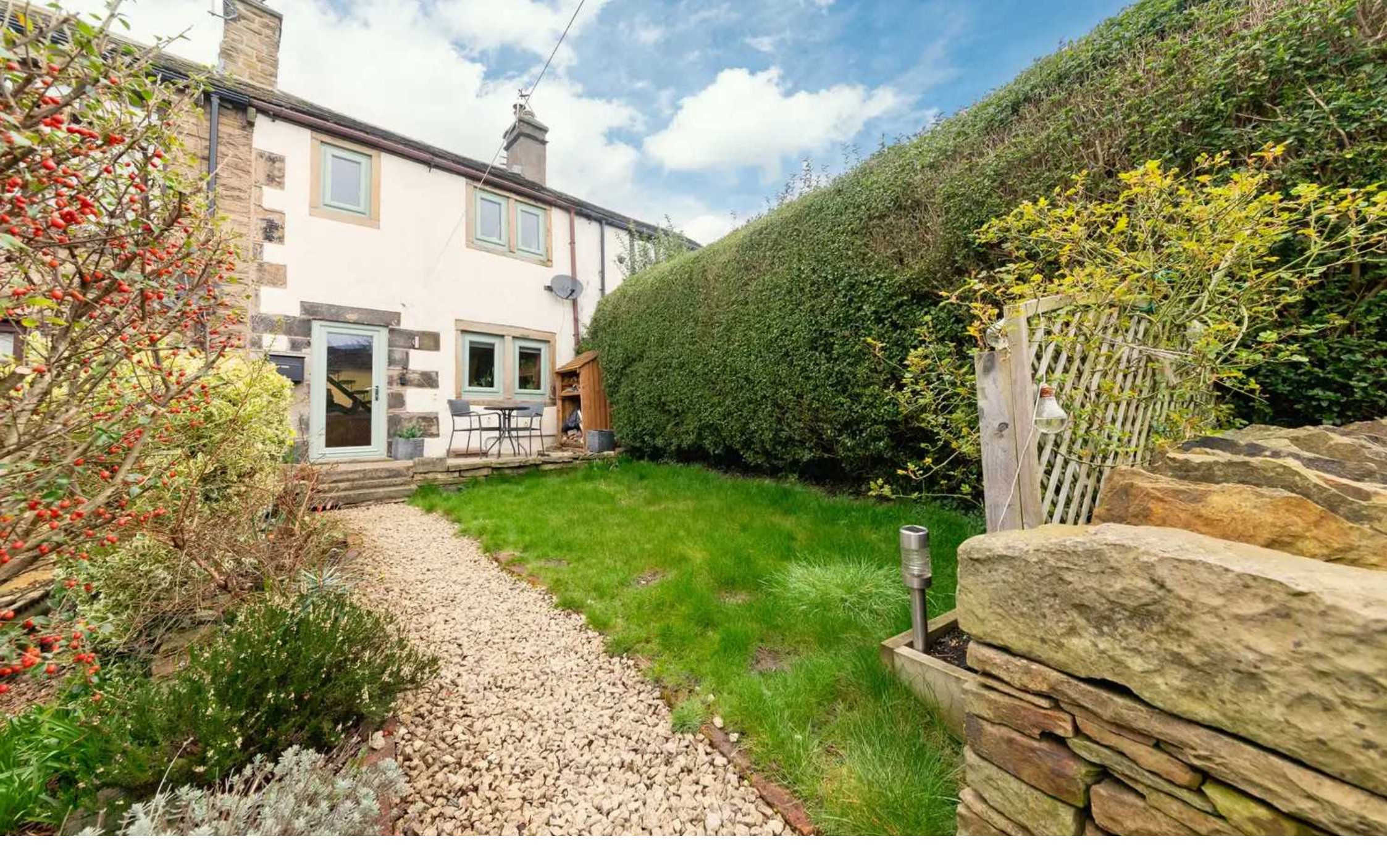
59 Gib Lane, Skelmanthorpe