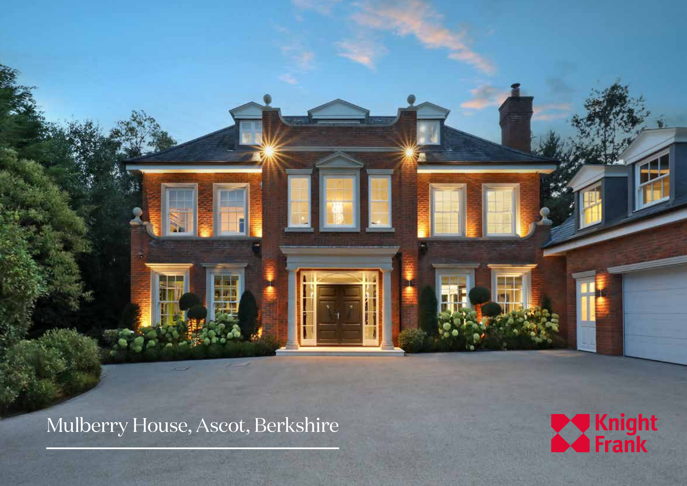
Mulberry House, Ascot, Berkshire