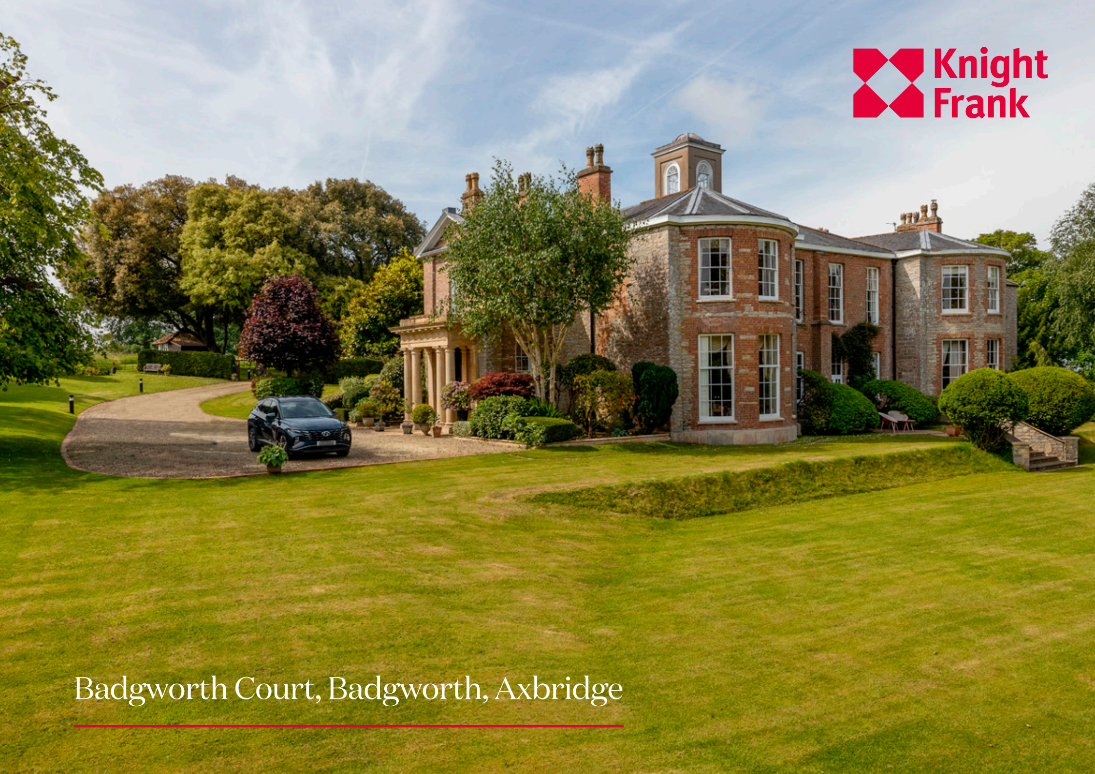
Badgworth Court, Badgworth, Axbridge