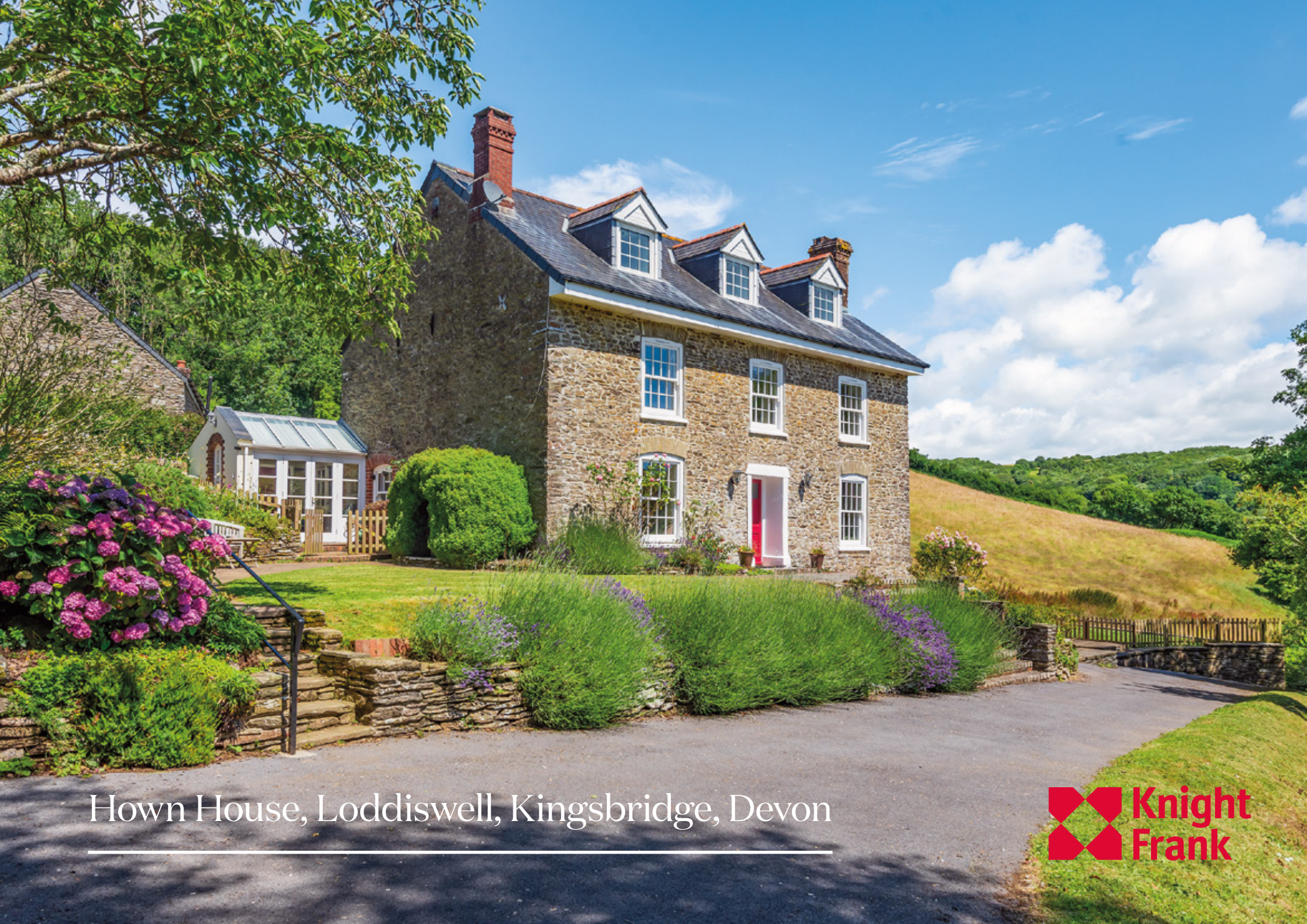
Hown House, Loddiswell, Kingsbridge, Devon