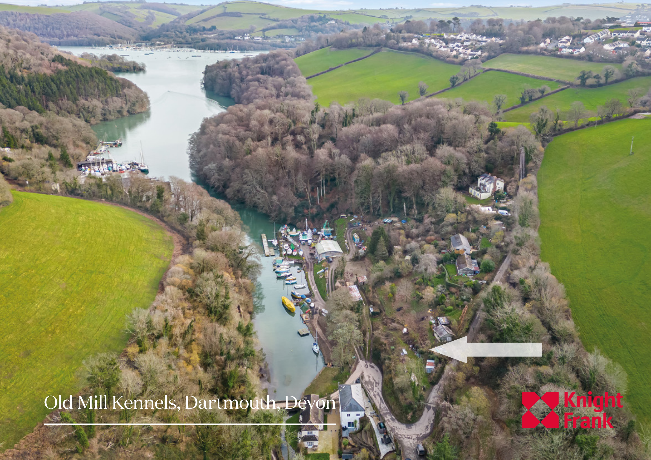
Old Mill Kennels, Dartmouth, Devon