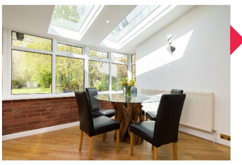
A wellappointed home, ideal for modern family living.