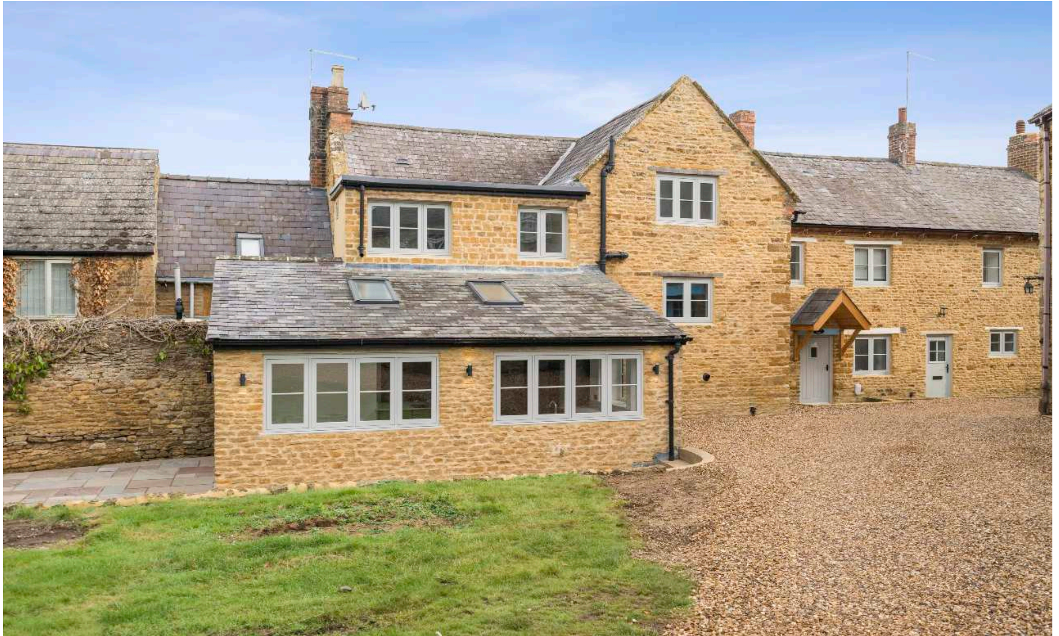
The Old House, Church Street, Boughton