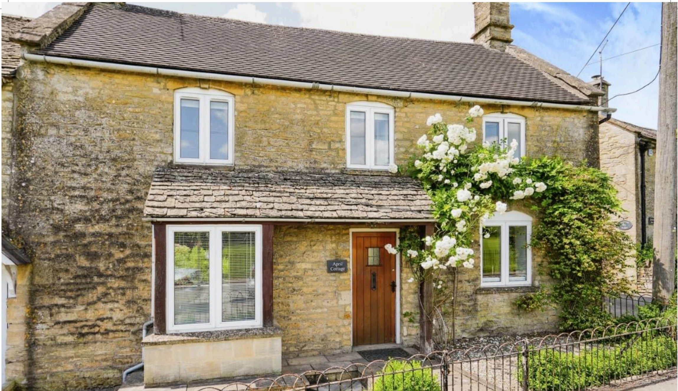
Milton-under-Wychwood, Chipping Norton