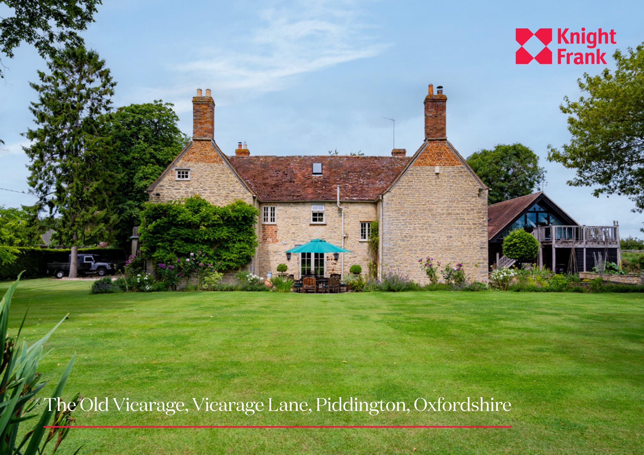
The Old Vicarage, Vicarage Lane, Piddington, Oxfordshire