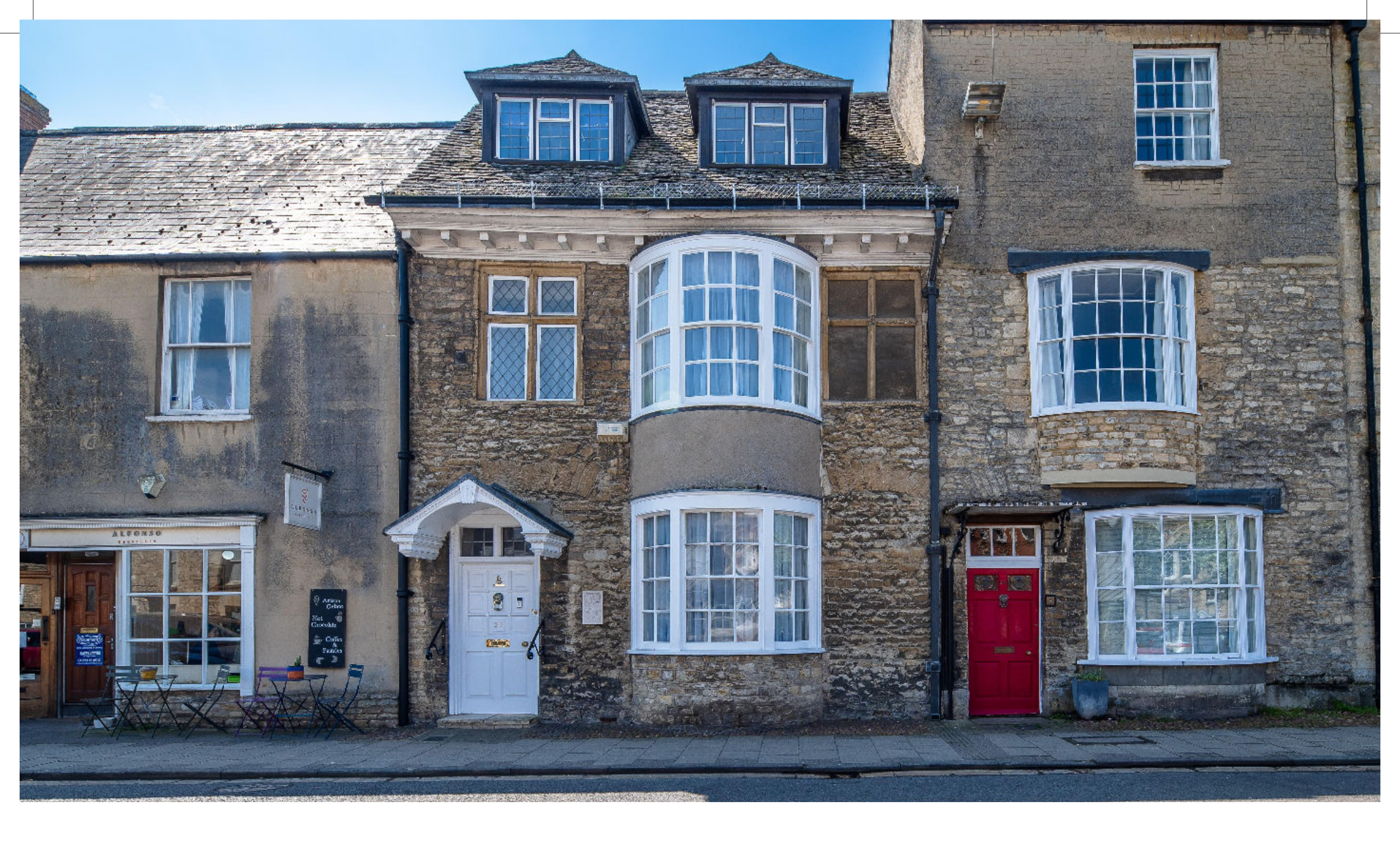
Cromwell House, Woodstock, Oxfordshire