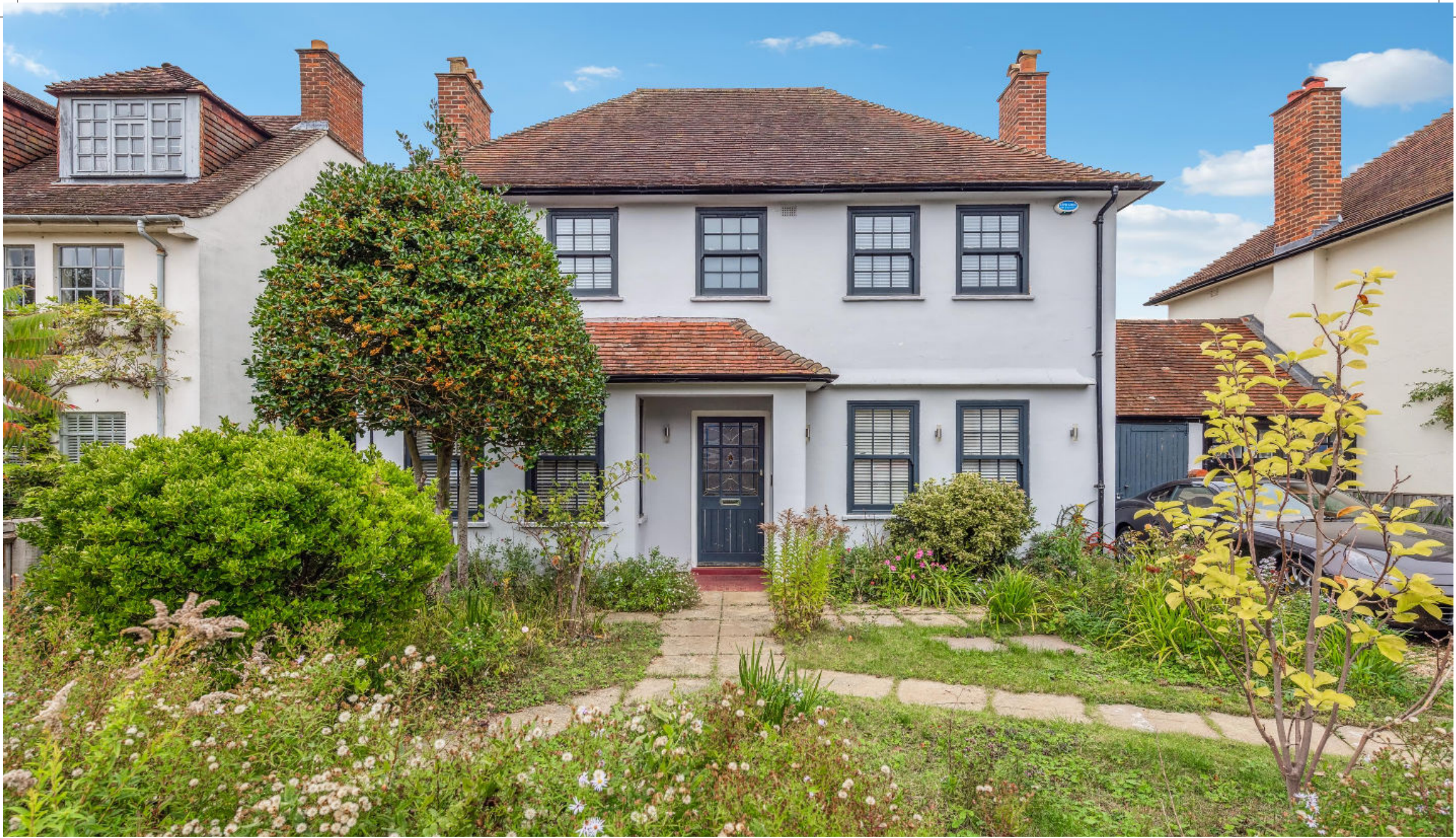
Lonsdale Road, Oxford