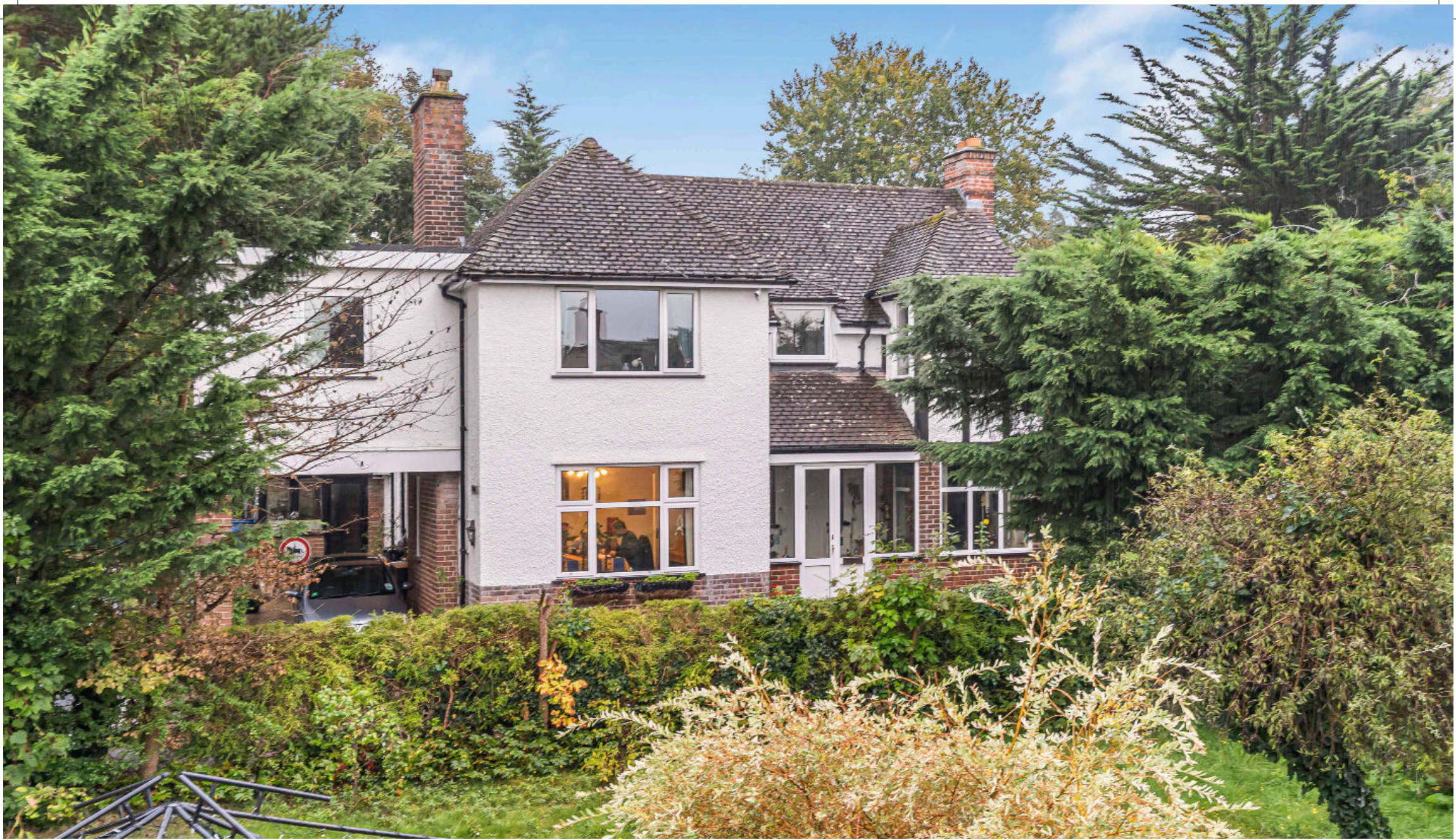
Tree Lane, Iffley, Oxford