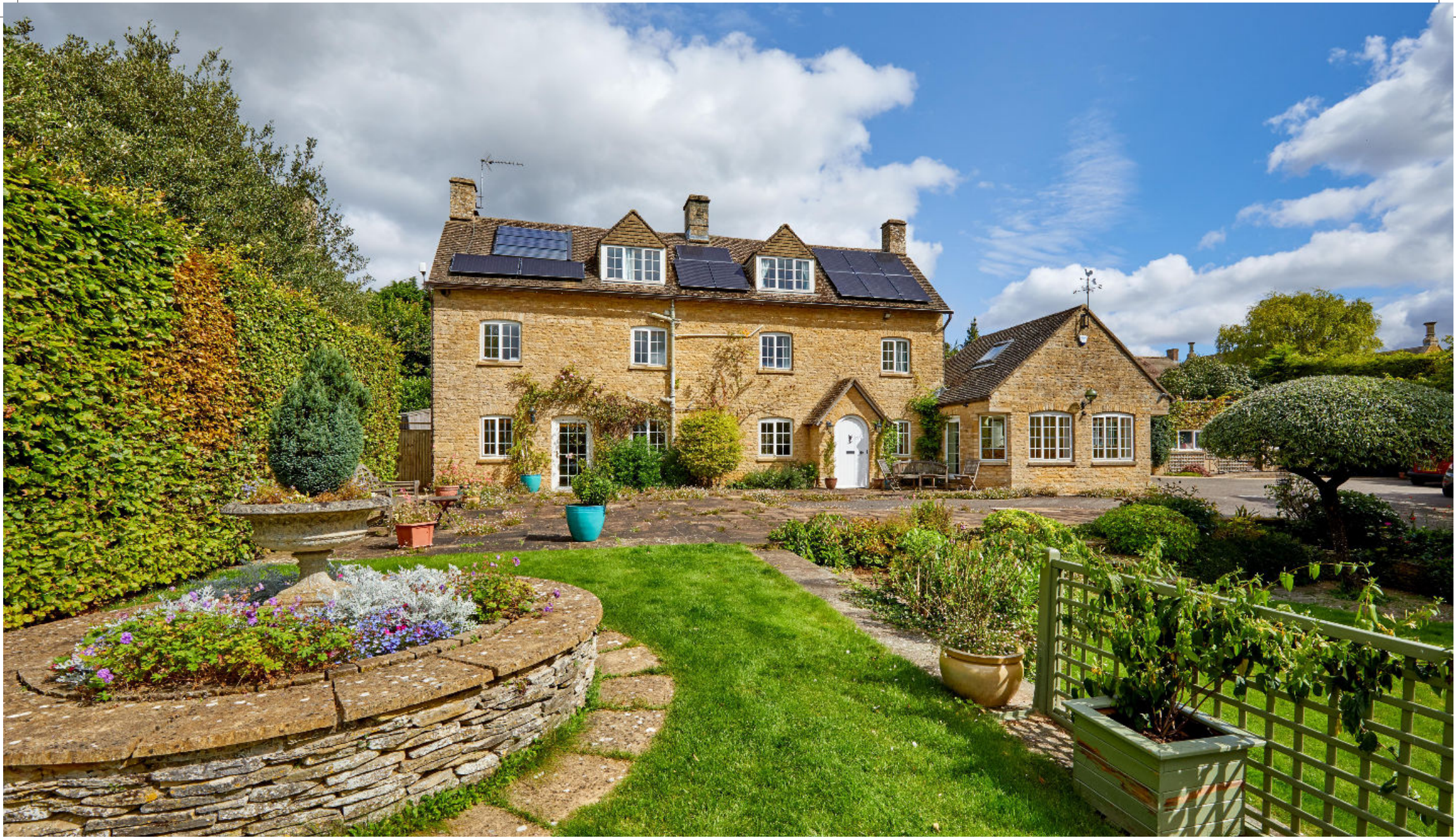
Chadlington, Chipping Norton