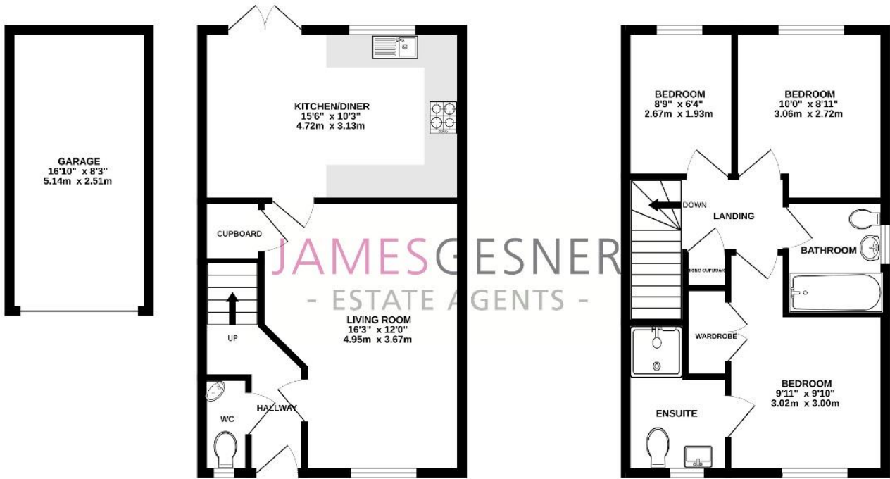
1ST FLOOR 415 sq.ft. (38.6 sq.m.) approx.