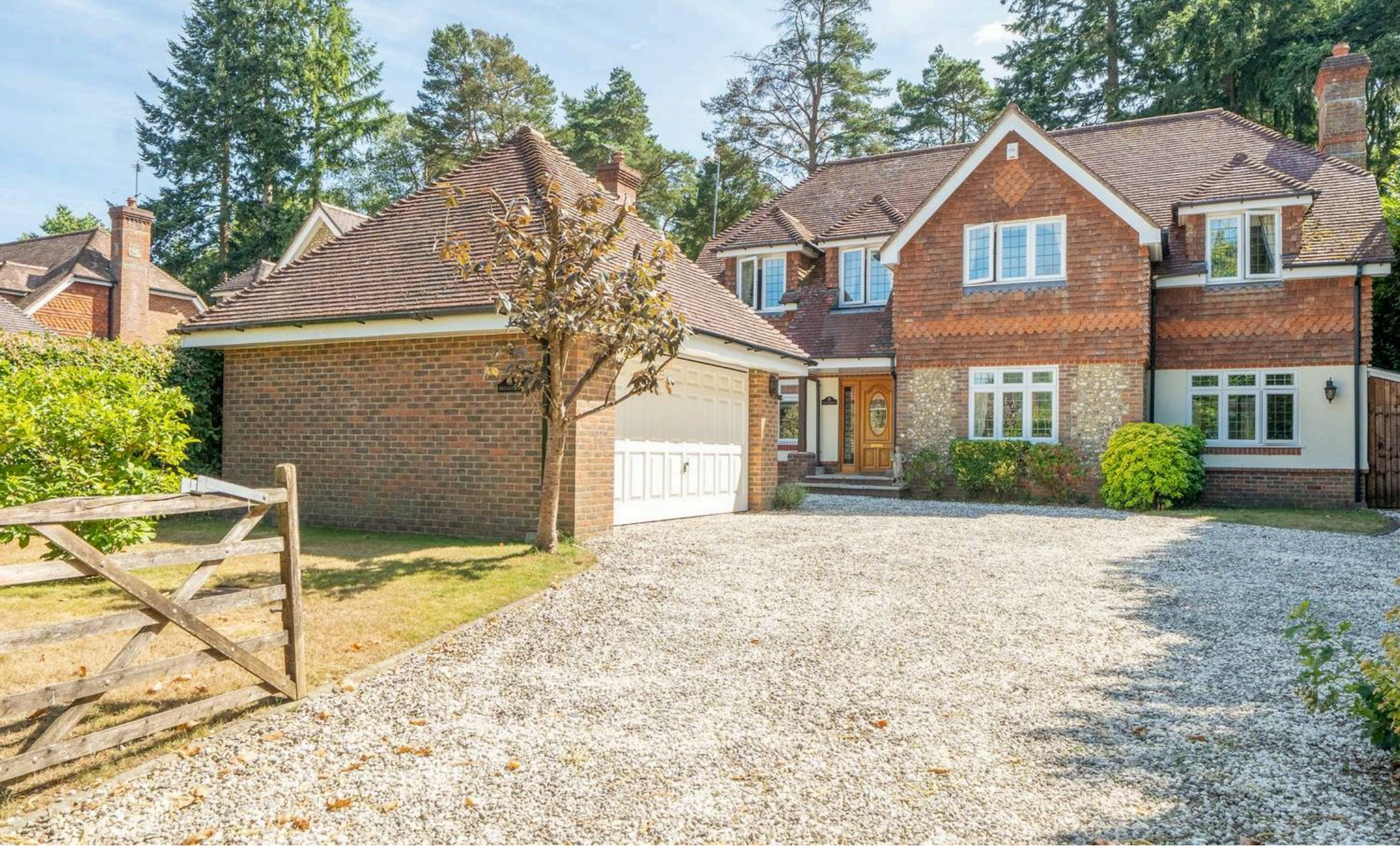
Briardale, Oakhill Road, Headley Down, GU25 8EW - Guide Price £995,000