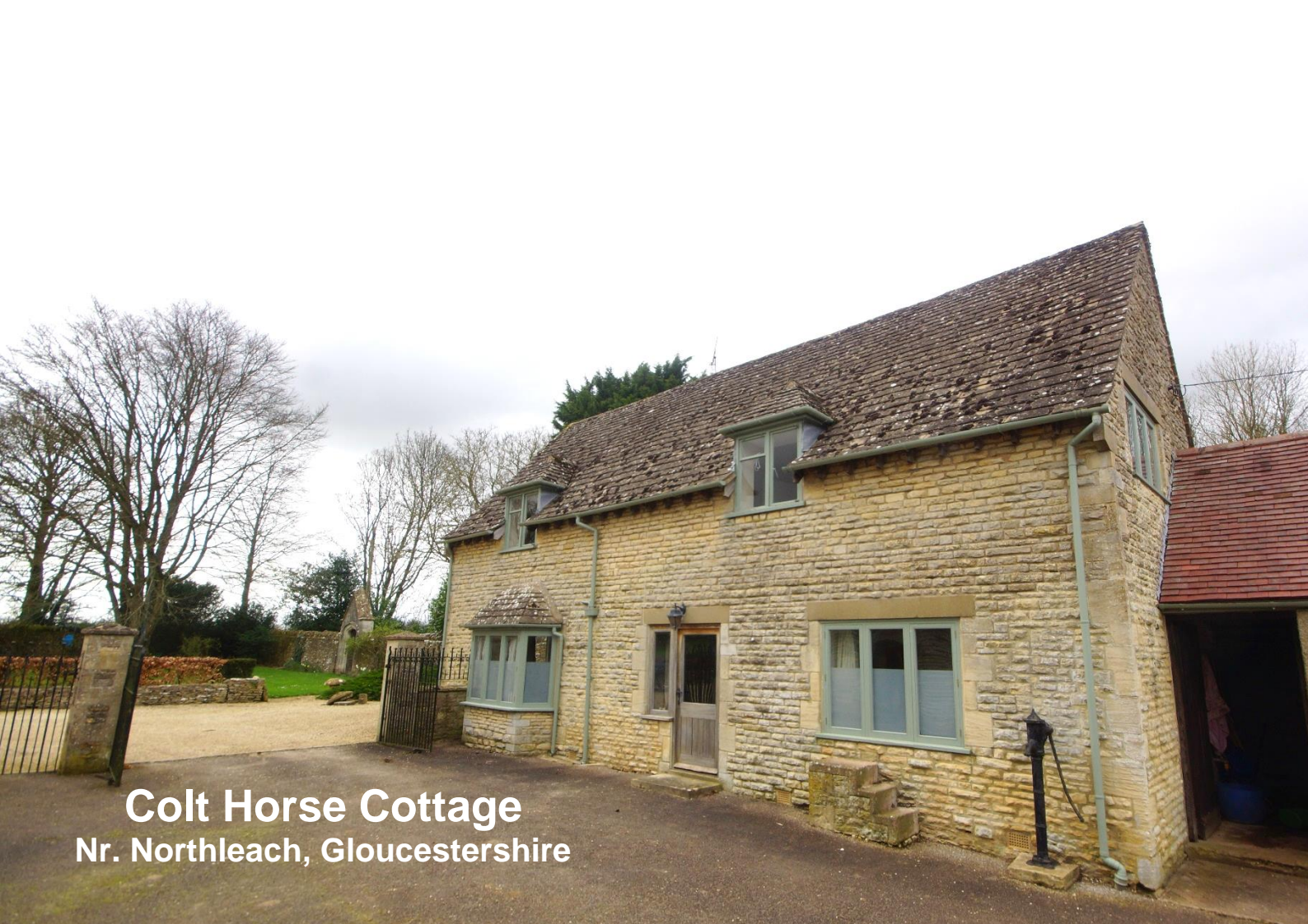
Colt Horse Cottage Nr. Northleach, Gloucestershire