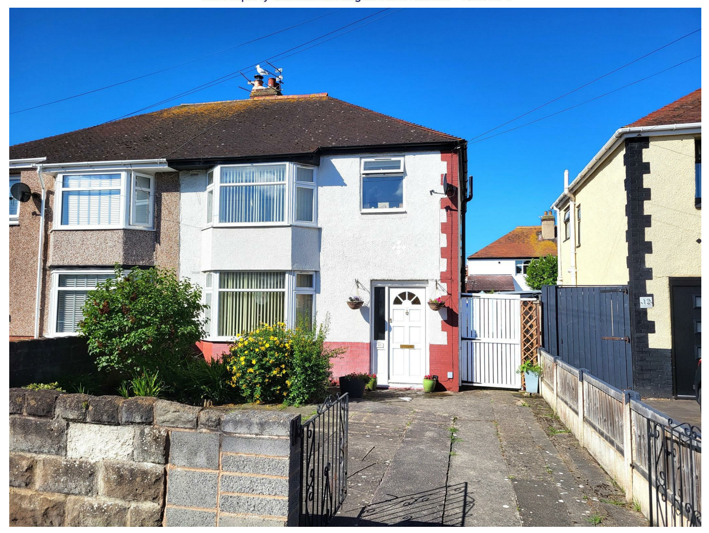
10 Princess Elizabeth Avenue, Rhyl, Clwyd LL18 4AP £170,000

Email: info@jonesandredfearn.com Website: www.jonesandredfearn.com The Property Ombudsman Registration Number - N00766-0