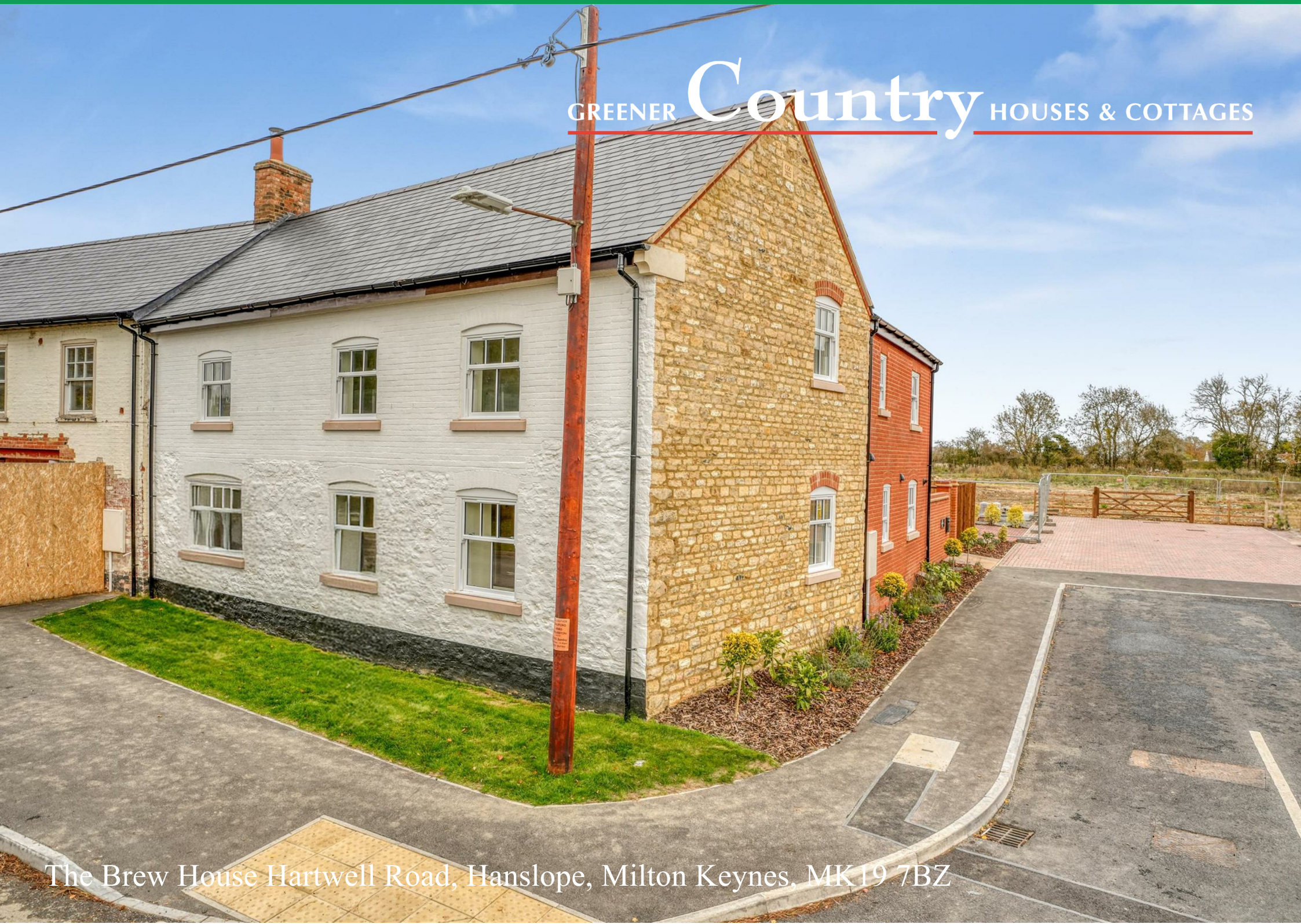
The Brew House Hartwell Road, Hanslope, Milton Keynes, MK19 7BZ