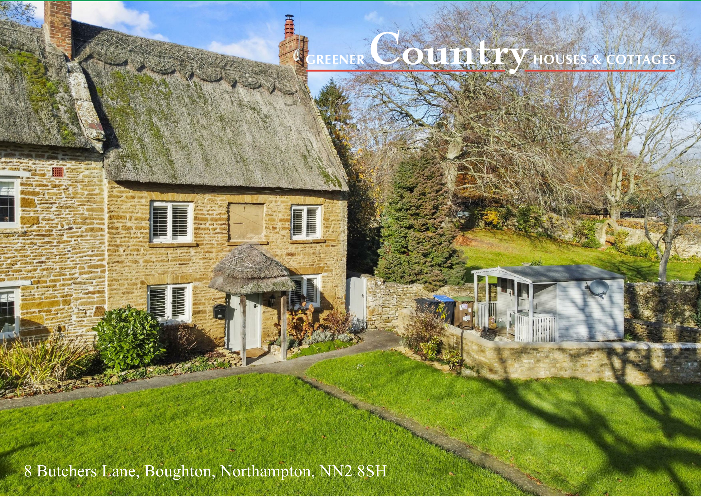
8 Butchers Lane, Boughton, Northampton, NN2 8SH