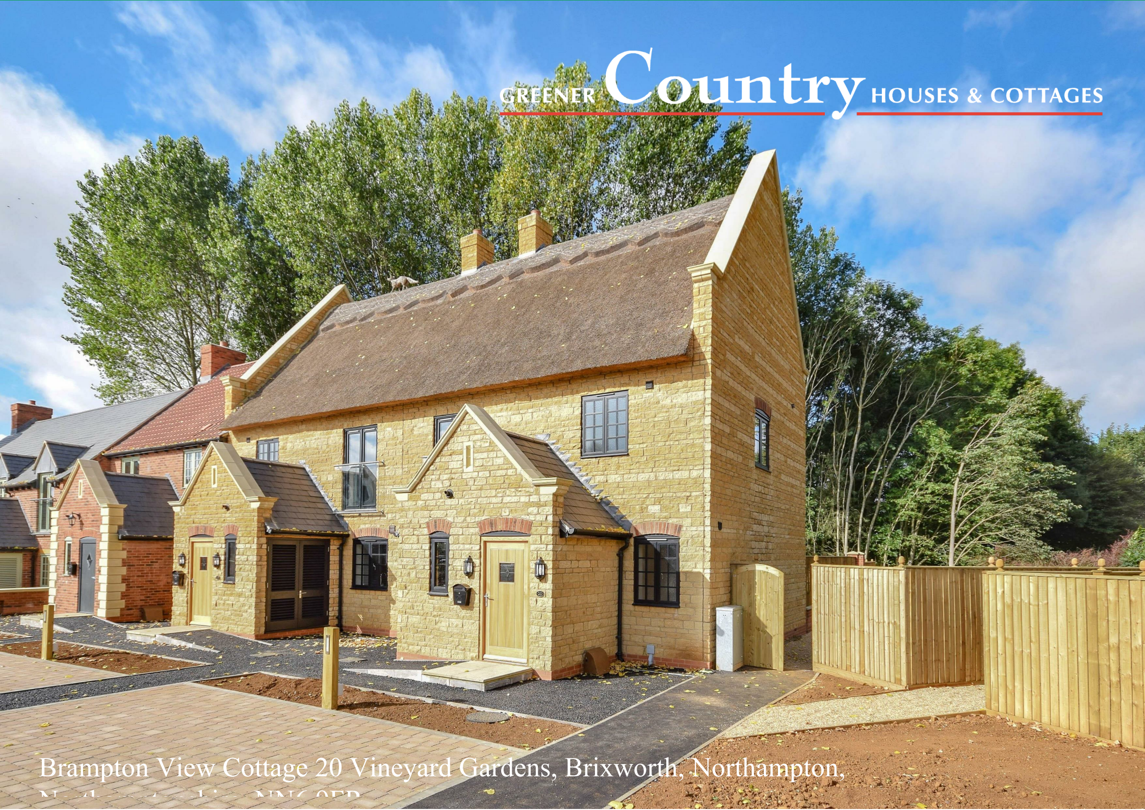
Brampton View Cottage 20 Vineyard Gardens, Brixworth, Northampton,