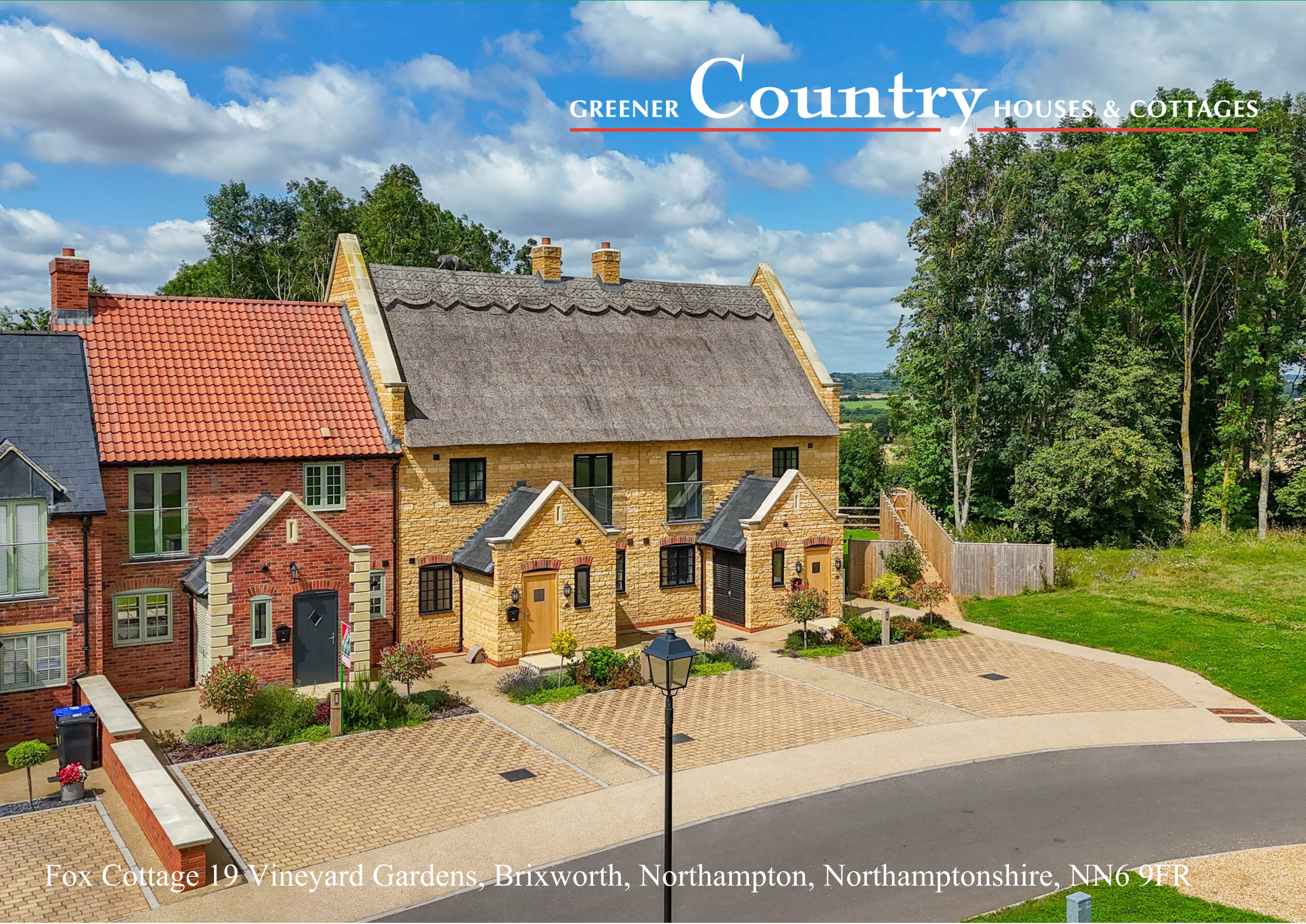
Fox Cottage 19 Vineyard Gardens, Brixworth, Northampton, Northamptonshire, NN6 9FR