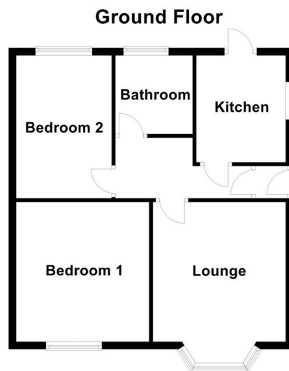
Not to scale. For illustrative purposes only