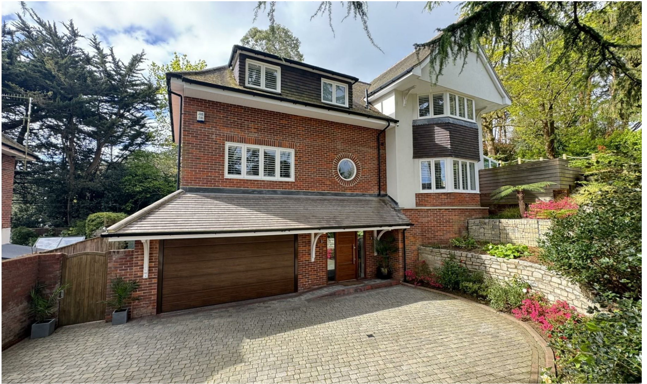
17a, Sylvan Heights Bingham Avenue, Poole, BH14 8ND £1,695,000