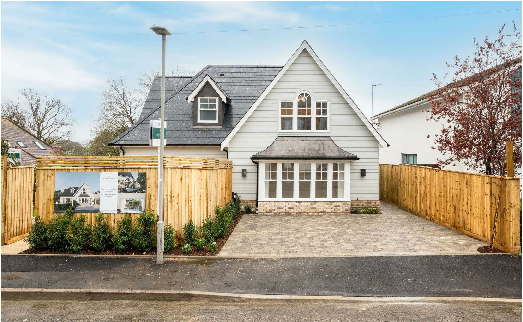
Plot 2, 3 Durrant Road, Lower Parkstone, Poole BH14 8TX £1,095,000 Freehold