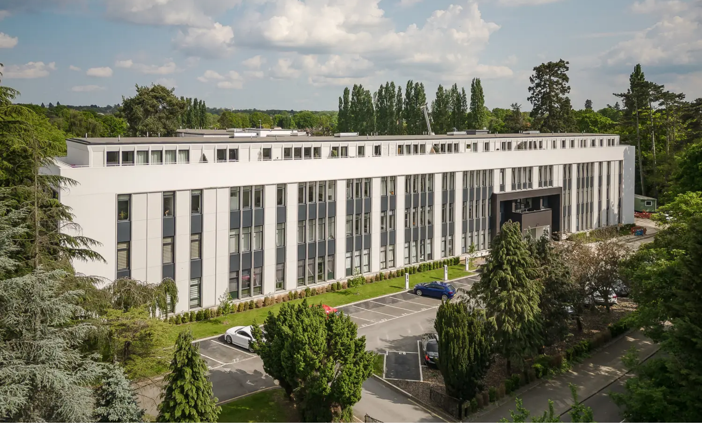
Flat 16, 4 Littleworth Road, Esher £2,000 pcm