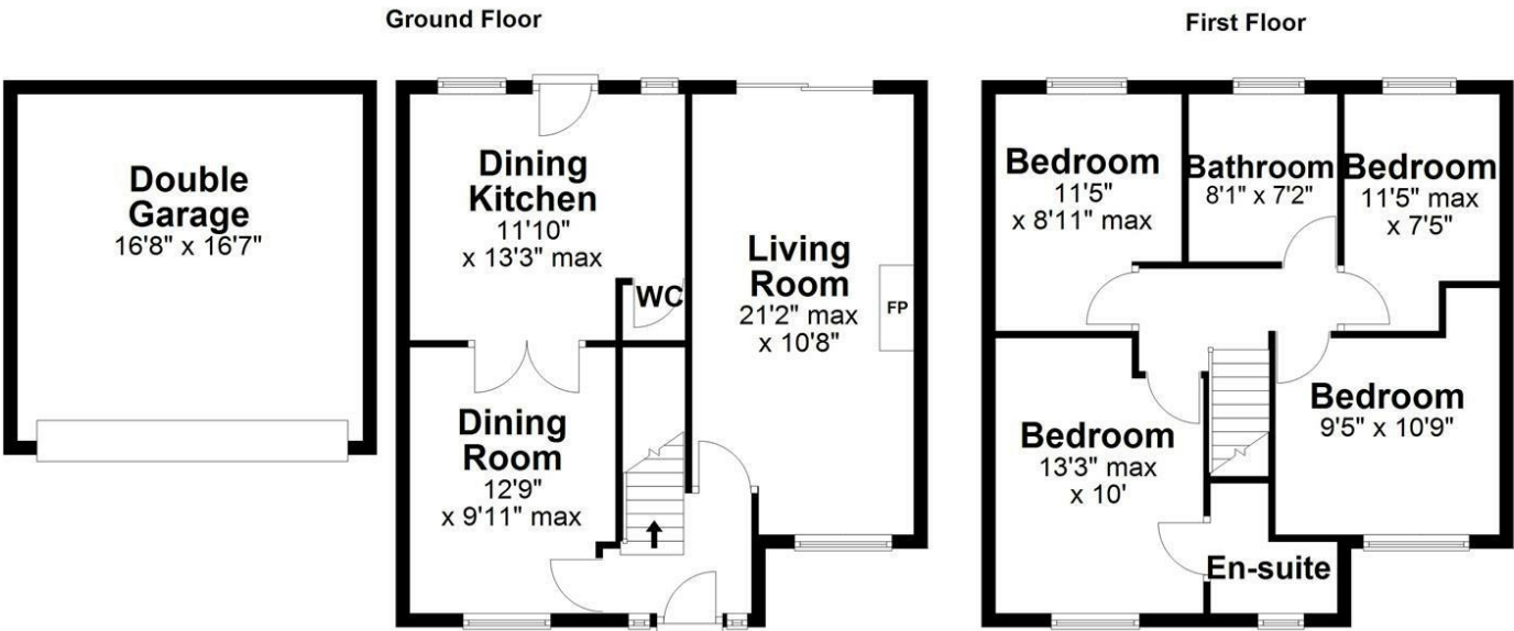
Total area: approx. 1429.2 sq. feet Bracken Close, Mirfield

These particulars, whilst believed to be accurate are set out as a general outline only for guidance and do not constitute any part of an offer or contract. Intending purchasers should not rely on them as statements of representation of fact, but must satisfy themselves by inspection or otherwise as to their accuracy. No person in this firms employment has the authority to make or give any representation or warranty in respect of the property.