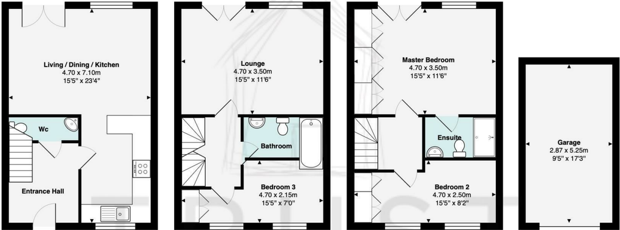
Radley Court, Mirfield, WF14 9FD