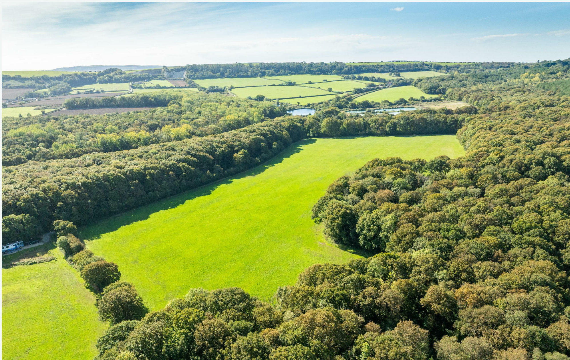
Land at Coombley Farm Lane, Havenstreet, Ryde, Isle of Wight