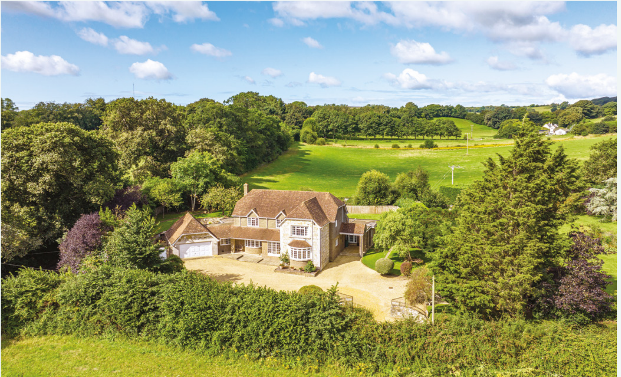
Kendal House, Marvel Lane, Blackwater, Isle of Wight