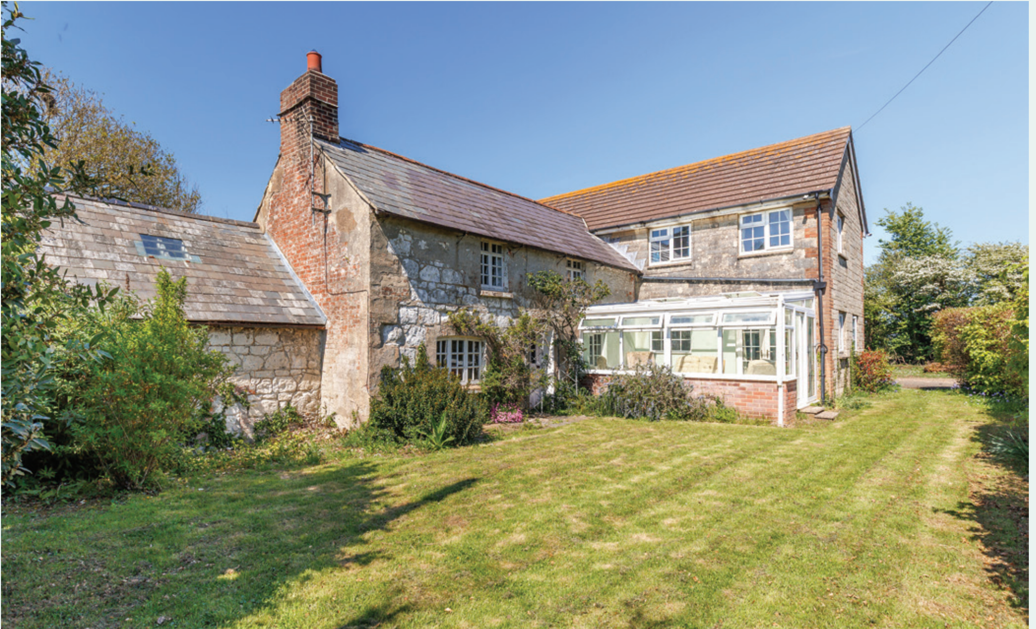
The Hollands, Hale Common, Arreton, Isle of Wight