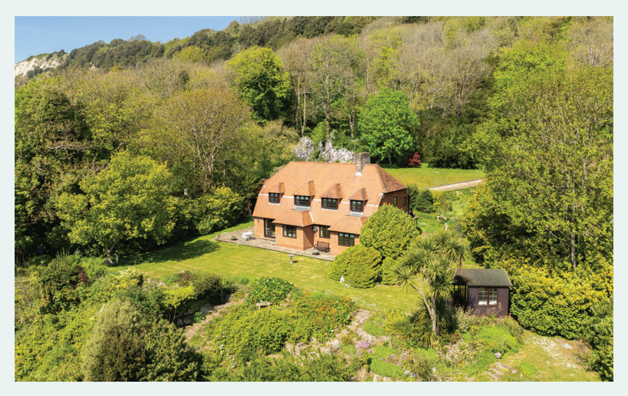
Nether Dene, Undercliff Drive St. Lawrence, Ventnor, Isle of Wight, PO38 1XX