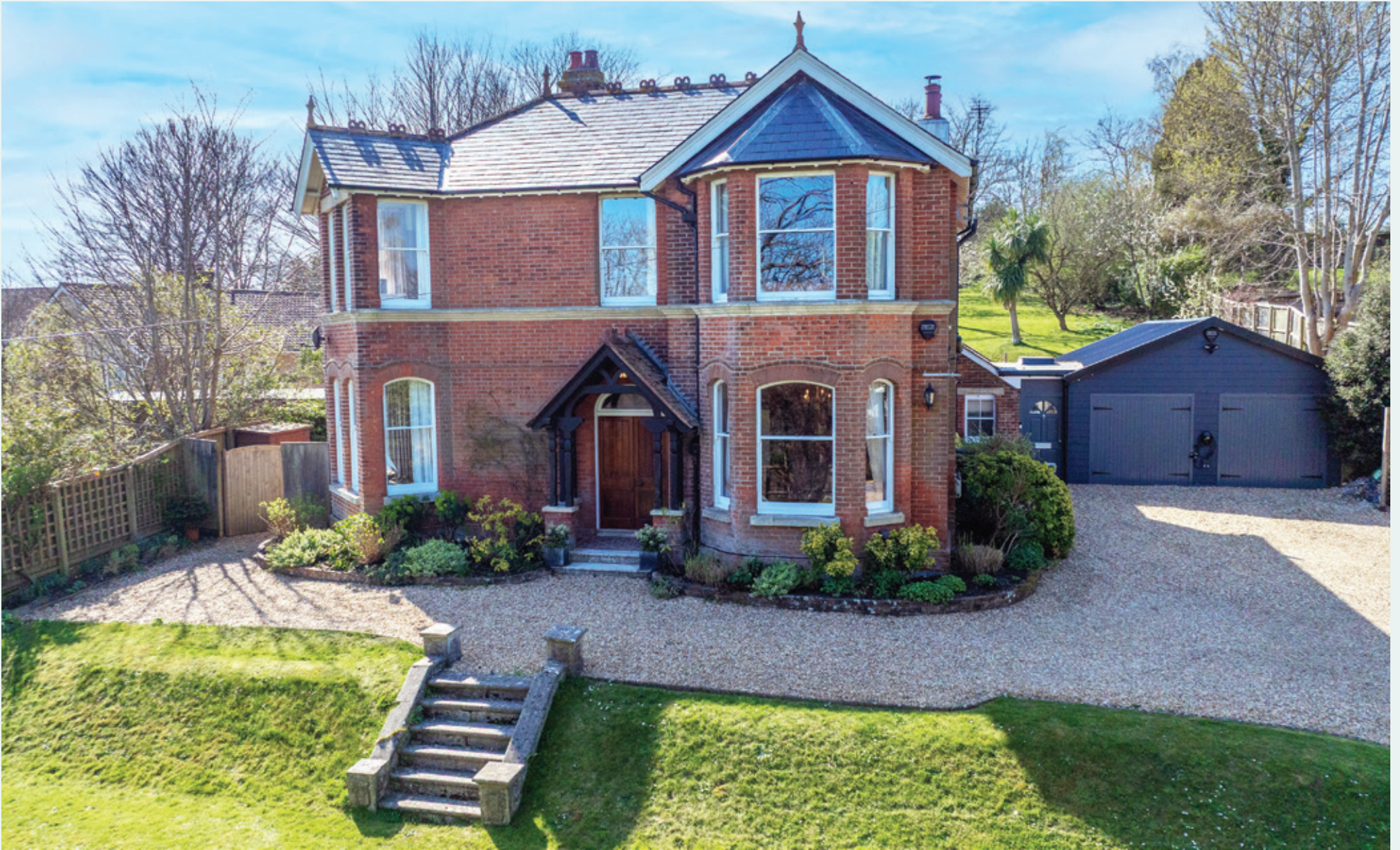
Thorncroft, 72 Watergate Road, Newport, Isle of Wight