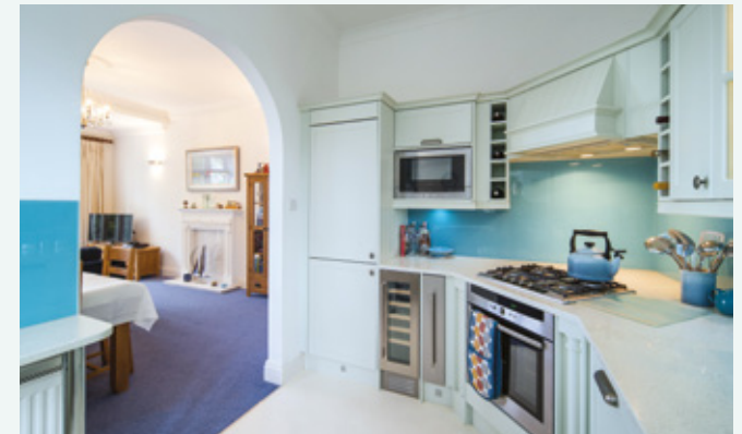
Apartment 9, Melcombe House, Queens Road, Cowes, Isle of Wight