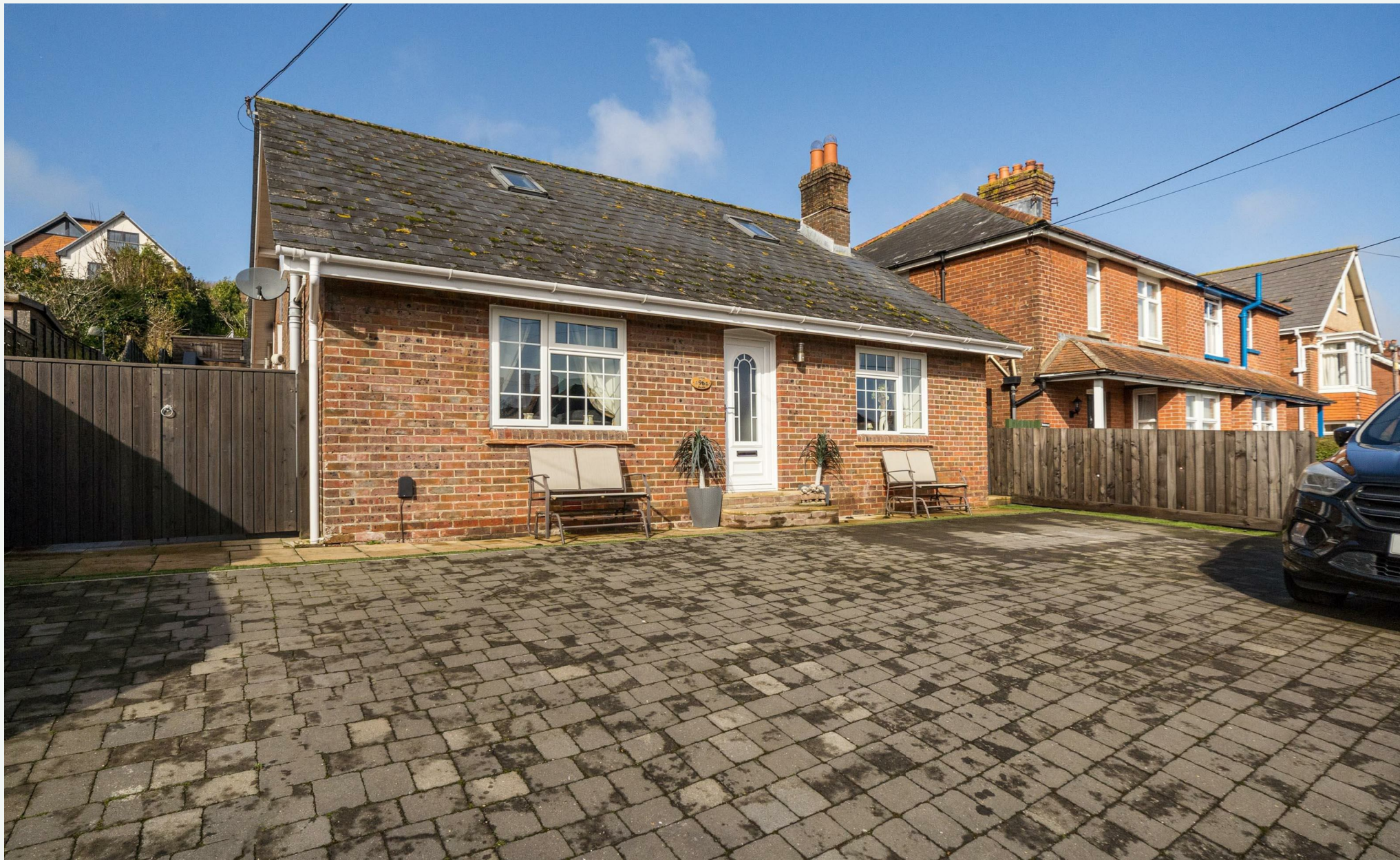
96, Clatterford Road, Carisbrooke, Isle of Wight