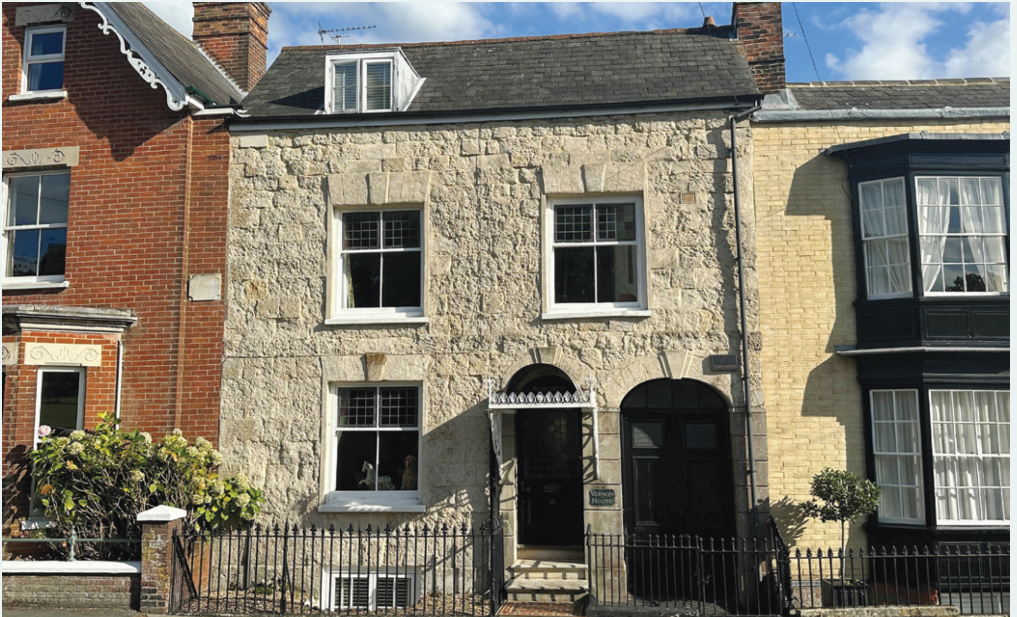
Vernon House, Union Road, Cowes, Isle of Wight