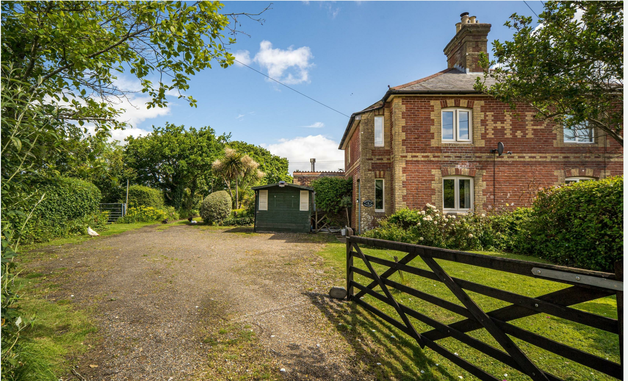
2 Binfield Cottages, Mill Lane, Binfield, Nr Newport, Isle of Wight