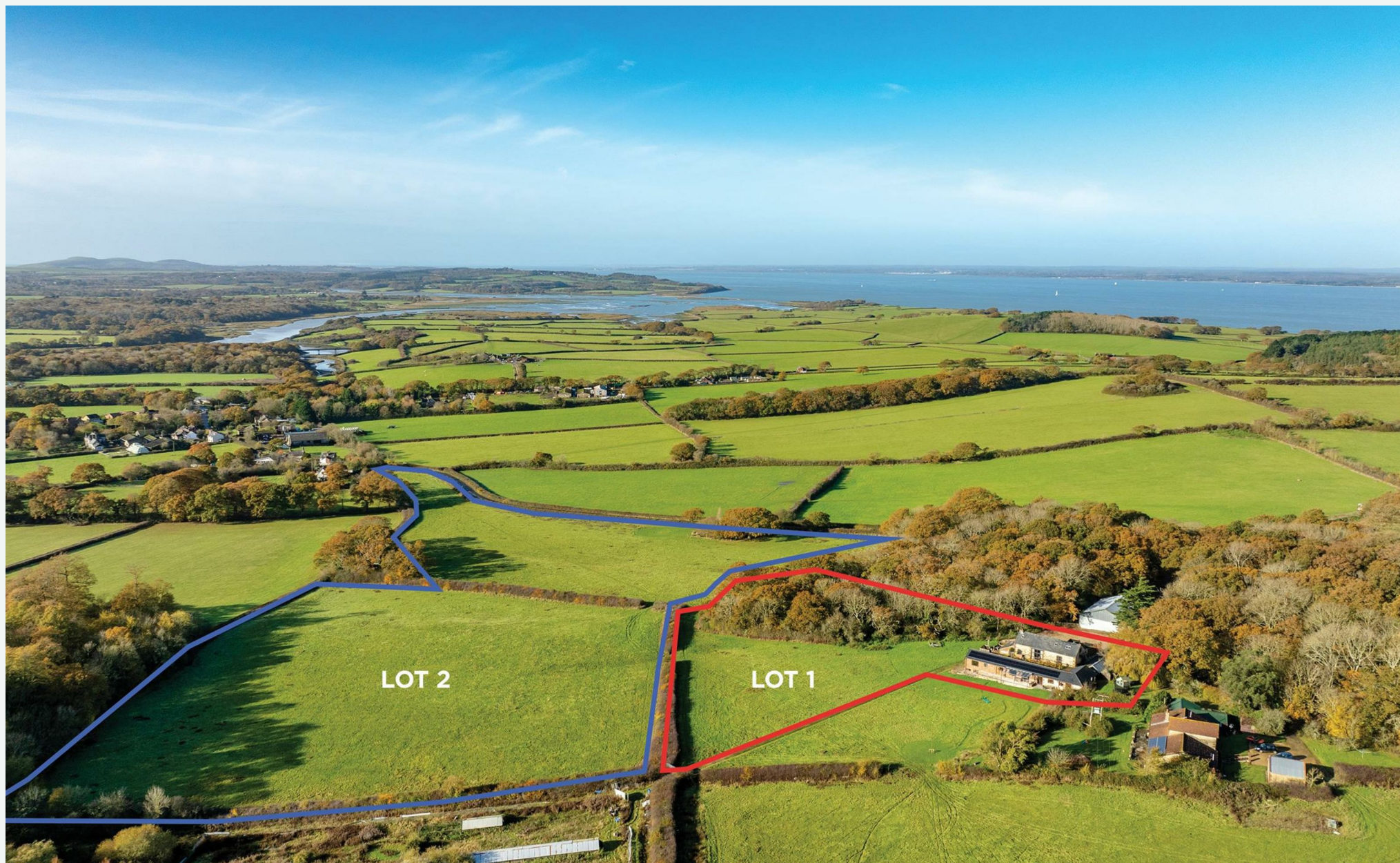
Land at Bunts Hill Farm, Whitehouse Cross, Porchfield, Isle of Wight, PO30 4LQ