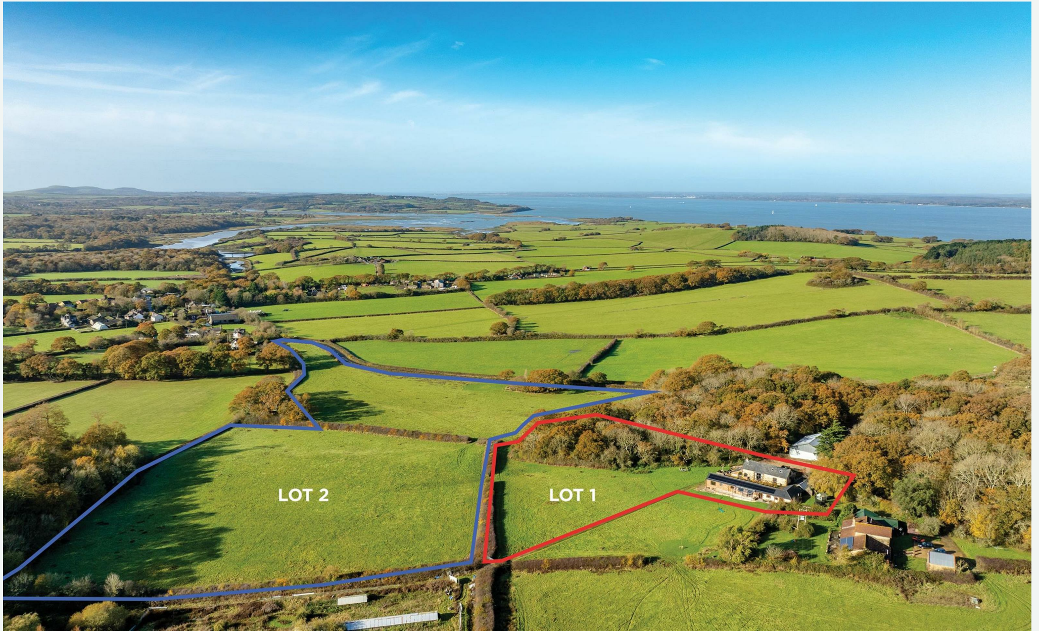
Land at Bunts Hill Farm, Whitehouse Cross, Porchfield, Isle of Wight, PO30 4LQ