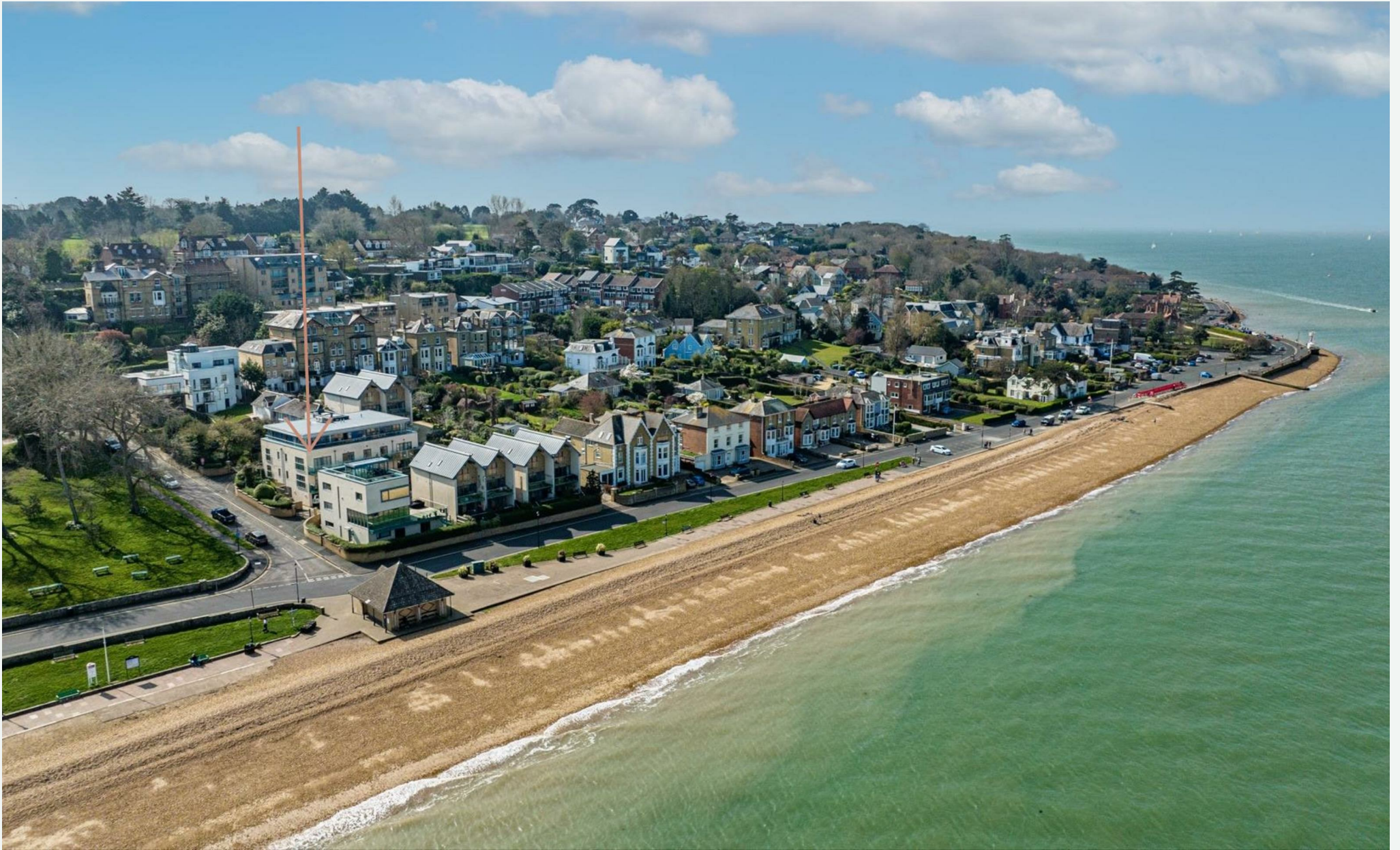
3 Mornington Mews, Cowes, Isle of Wight